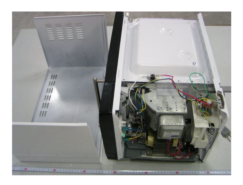
EUT – Box Inside View