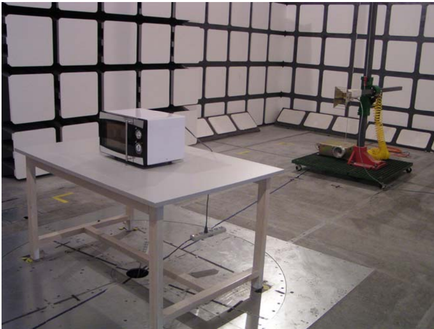
Radiated Emission (Above 1 GHz) - Rear View