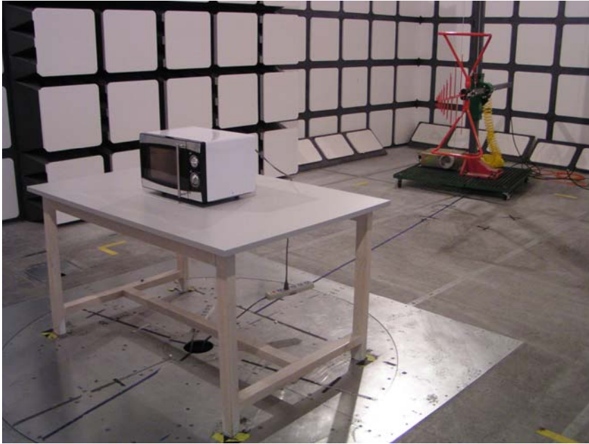
Radiated Emission (30MHz to 1000MHz) - Rear View