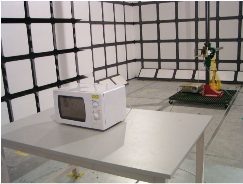
Above 1 GHz -Radiated Emission–Rear View