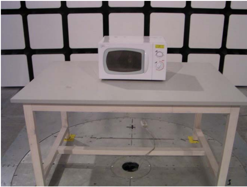
30 MHz to 1000 MHz- Radiated Emission–Rear View