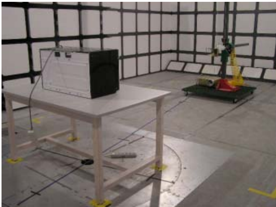
Above 1 GHz: Radiated Emission - Rear View