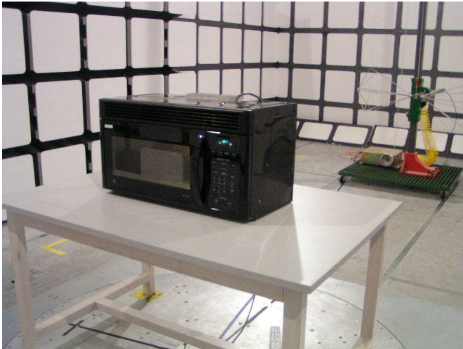
30MHz to 1000MHz: Radiated Emission - Rear View