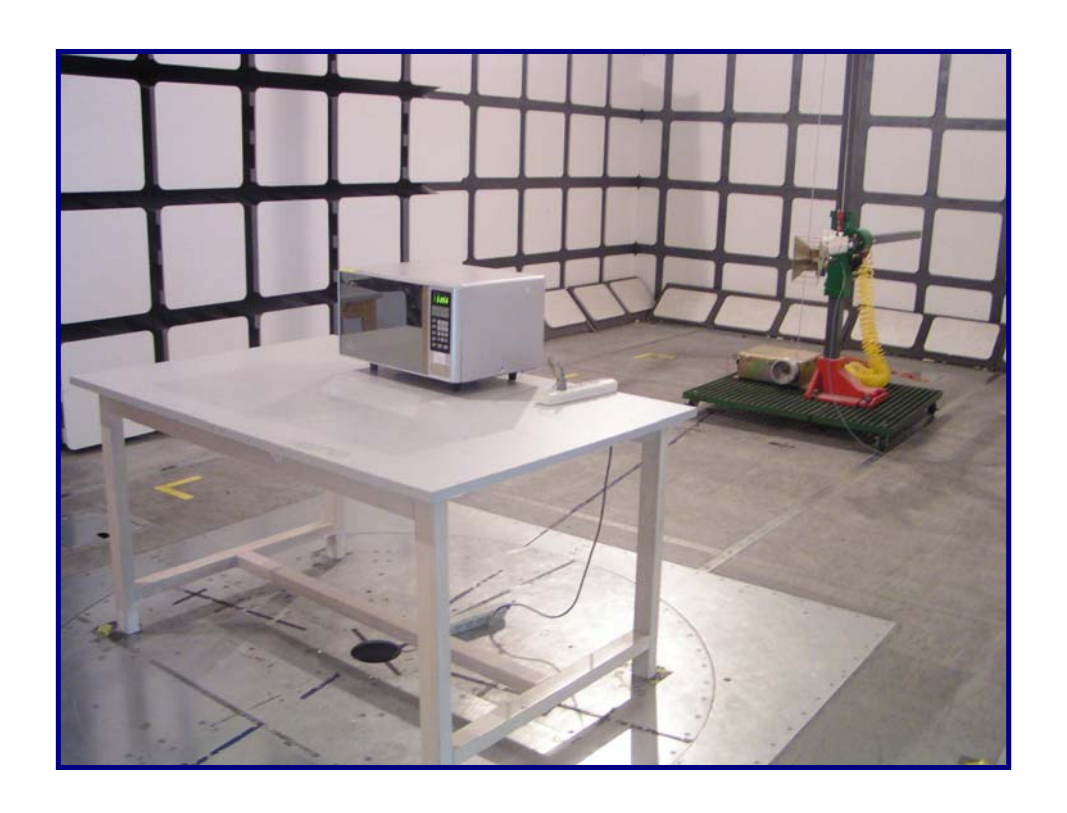
Above 1 GHz: Radiated Emissions - Rear View