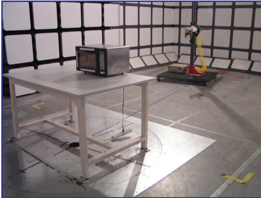
Radiated Emissions (Above 1 GHz) - Rear View