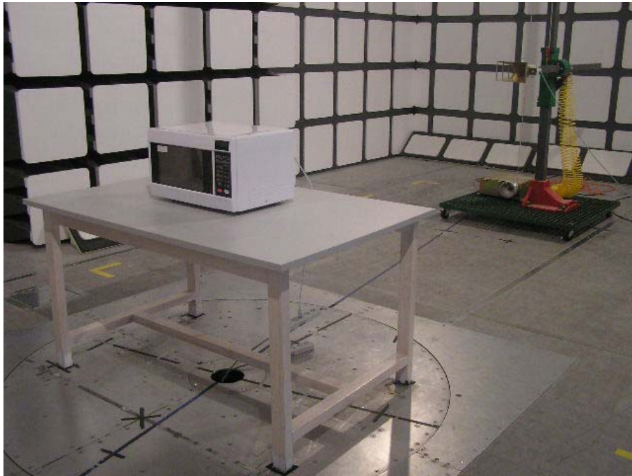
Radiated Emission (Above 1 GHz) - Rear View