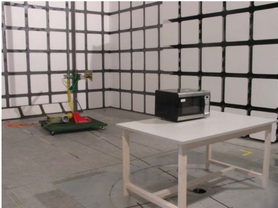
Radiated Emission (Above 1 GHz) - Rear View