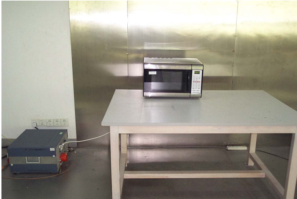
Conducted Emission - Rear View