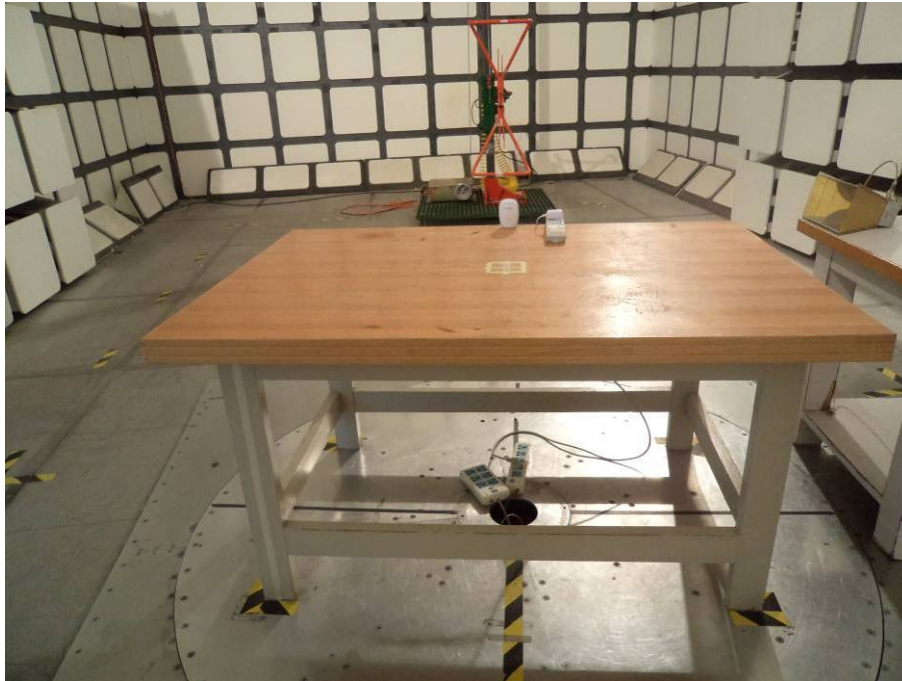
Radiated Emissions – Rear View (Below 1 GHz)