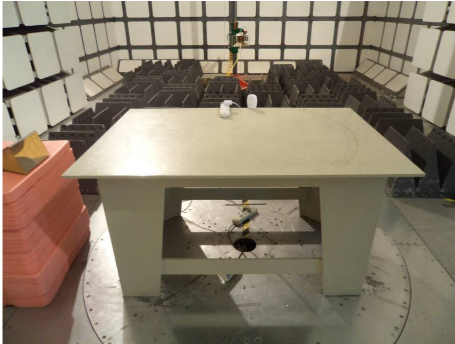
Radiated Emissions – Rear View (Above 1 GHz)