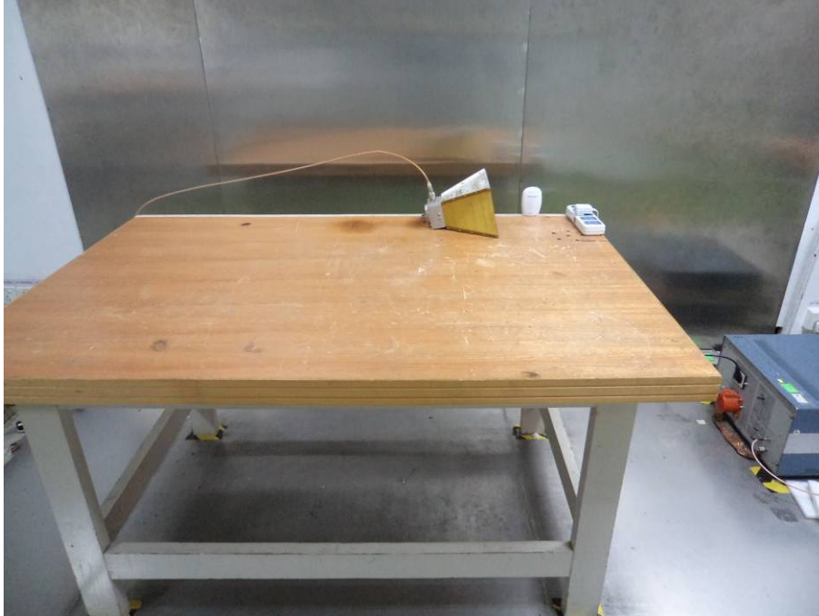
Conducted Emissions – Side View