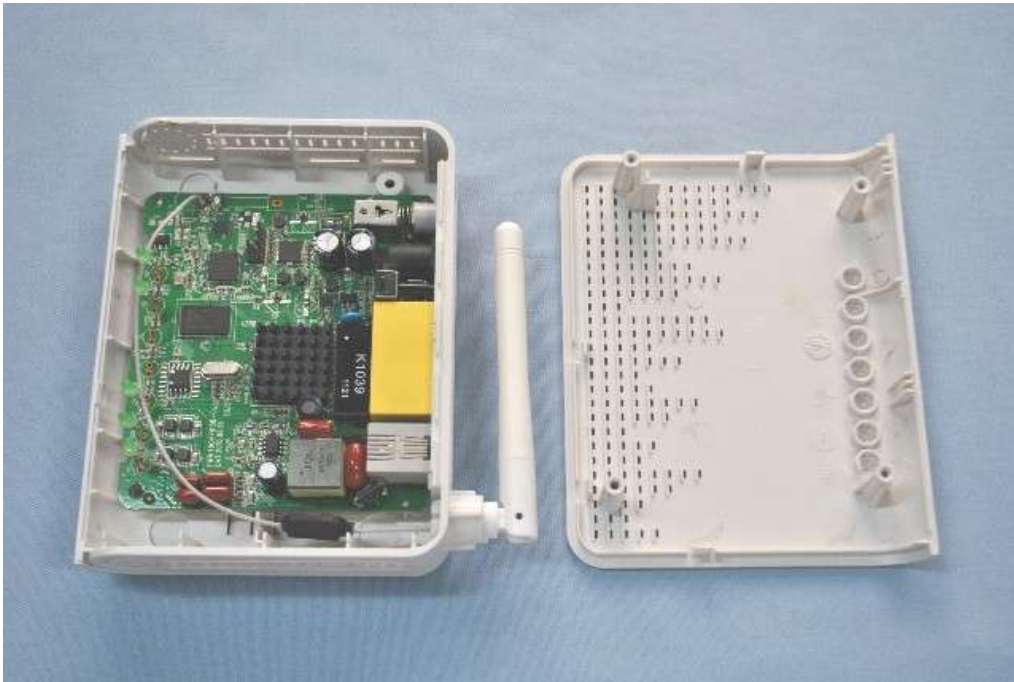
Main & RF board component side