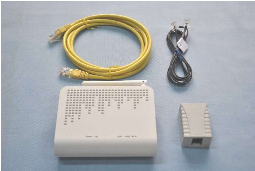
EUT top view