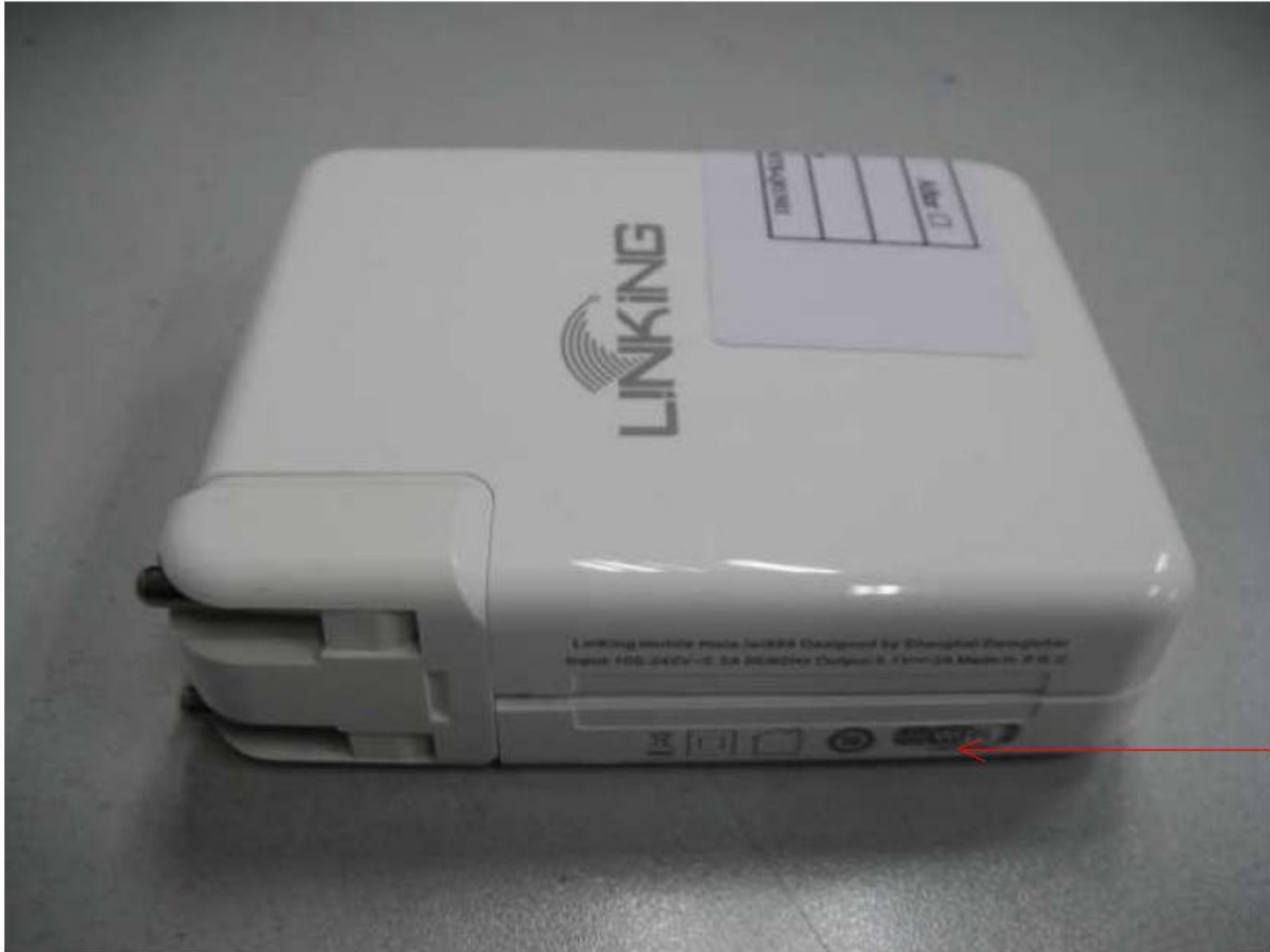
Label FCC ID:RS3IWI666