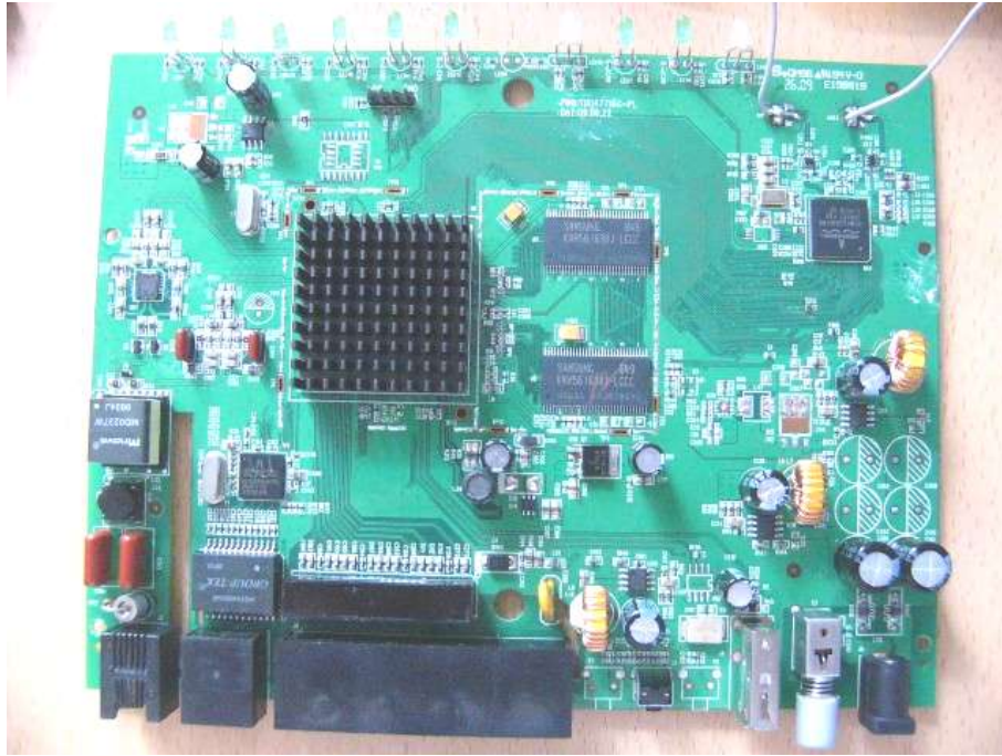
Main & RF board solder side