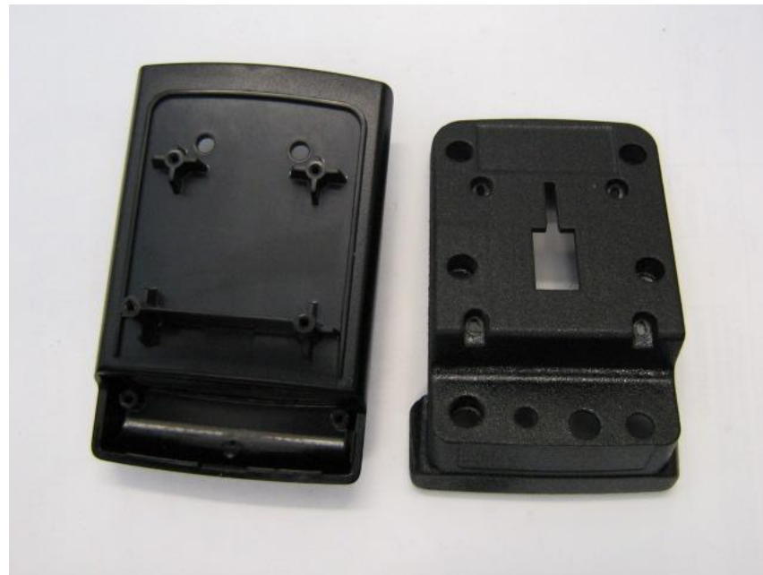
Case Open with PCBs Removed