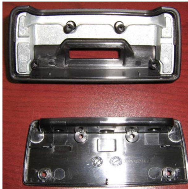
Case Open with PCBs Removed