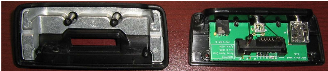
Case Open with PCB Inside