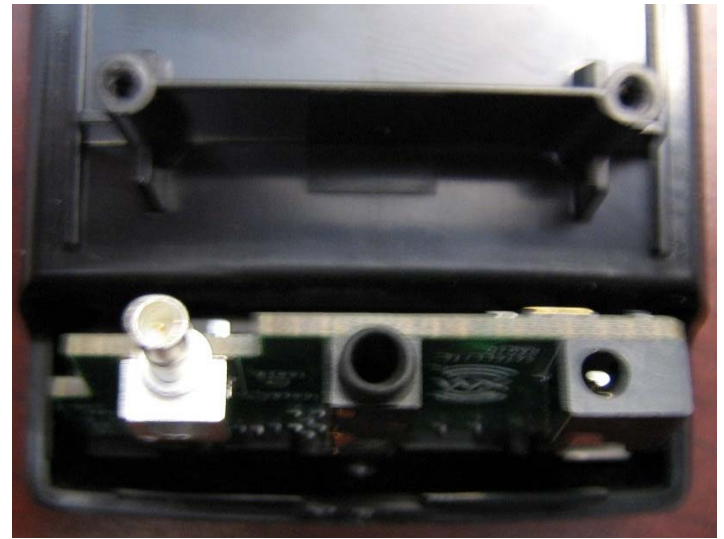
Case Open with PCB Inside