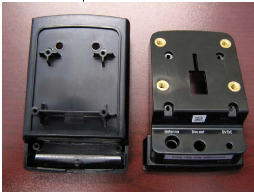
Case Open with PCBs Removed