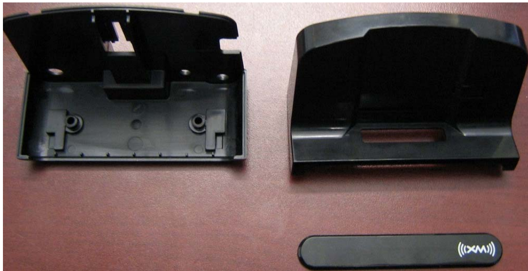
Case Open with PCBs Removed