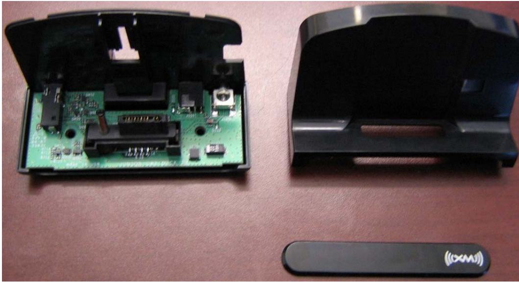
Case Open with PCB Inside