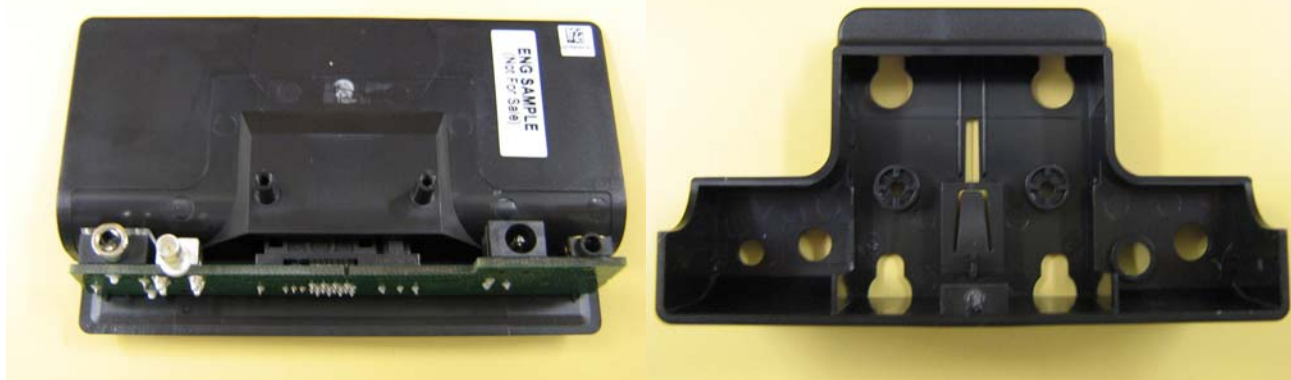
Front and Rear Housing with PCBA