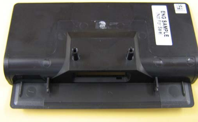
Front Housing without PCBA