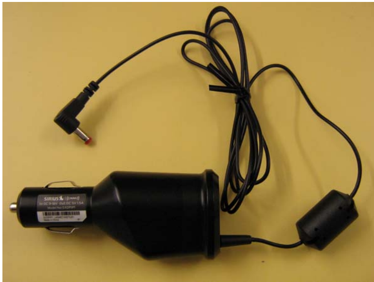
Overall View with Cable Assembly