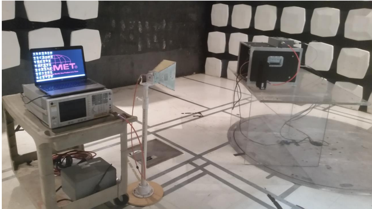
Photograph 5. Radiated Emissions, Above 1 GHz