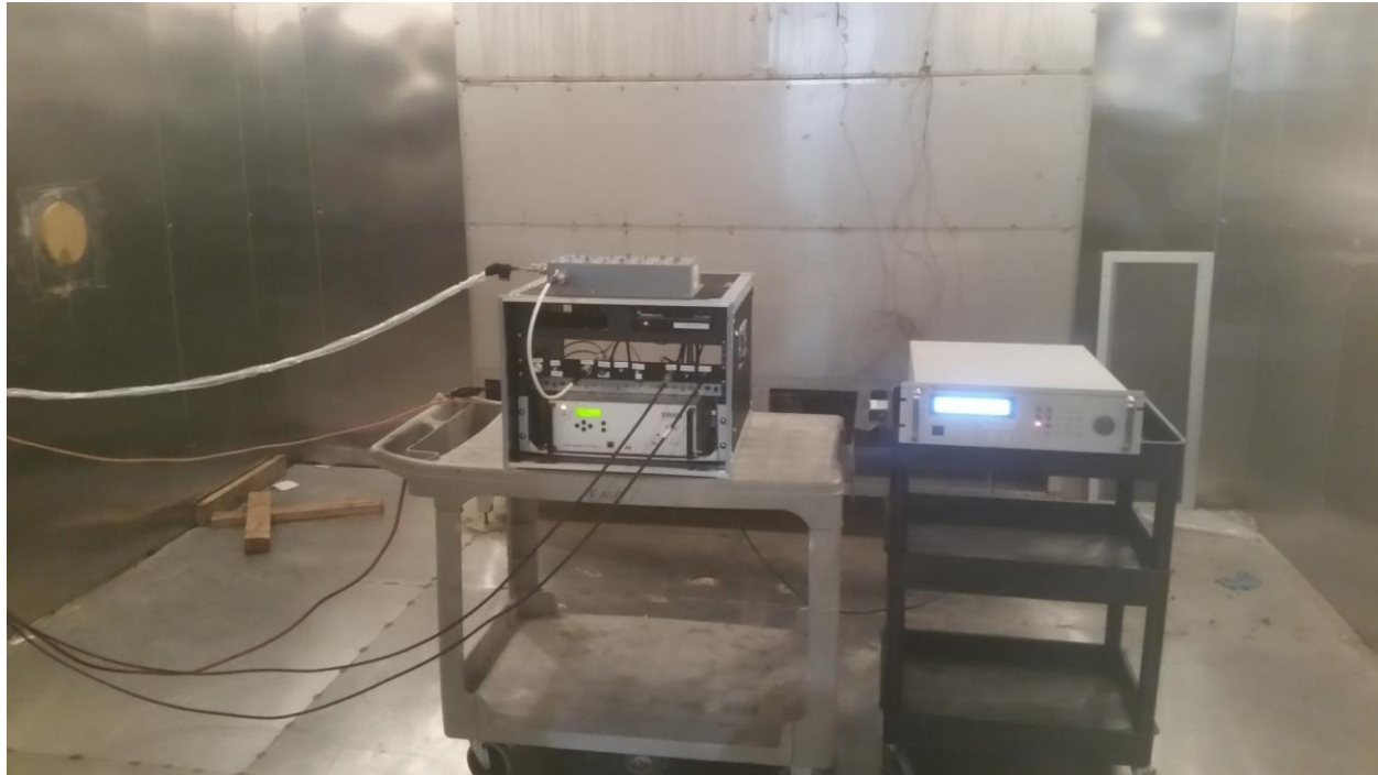
Photograph 3. Frequency Stability, Voltage