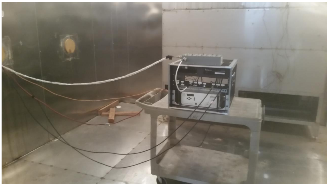
Photograph 2. Frequency Stability, Temperature