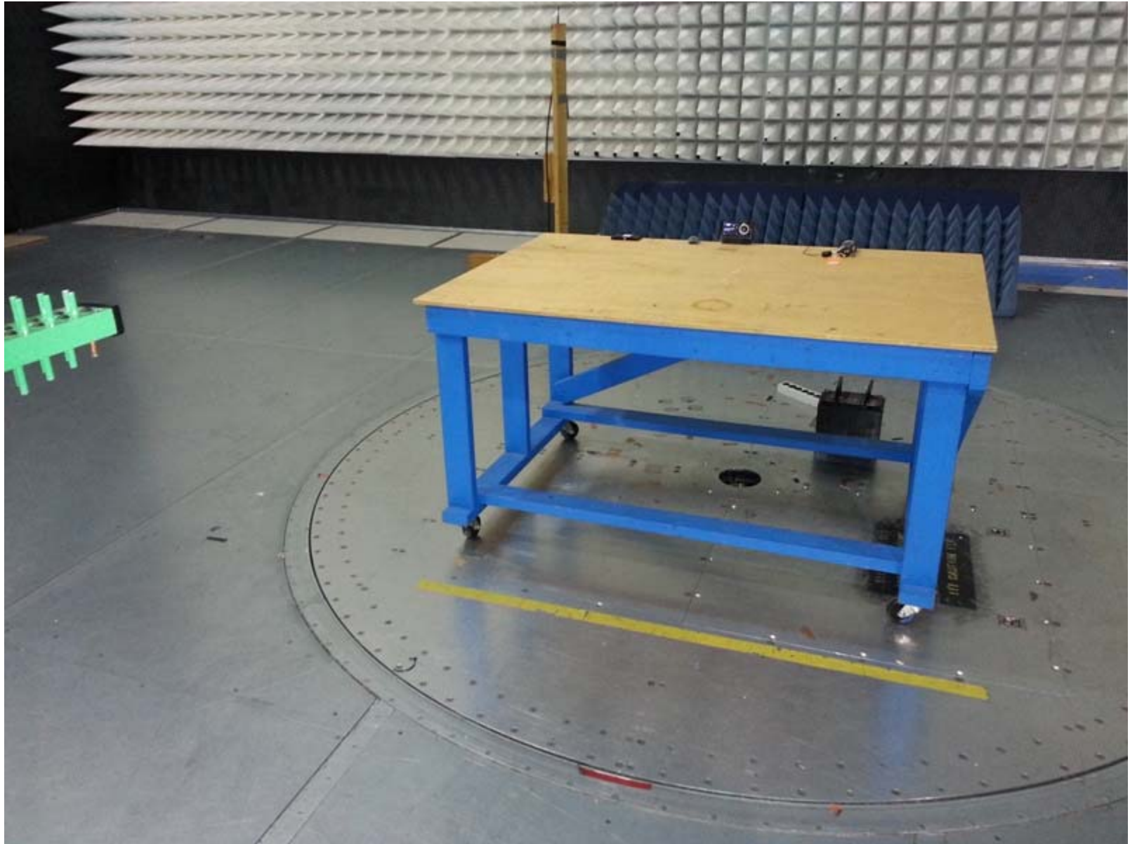
Radiated Emissions - Front View