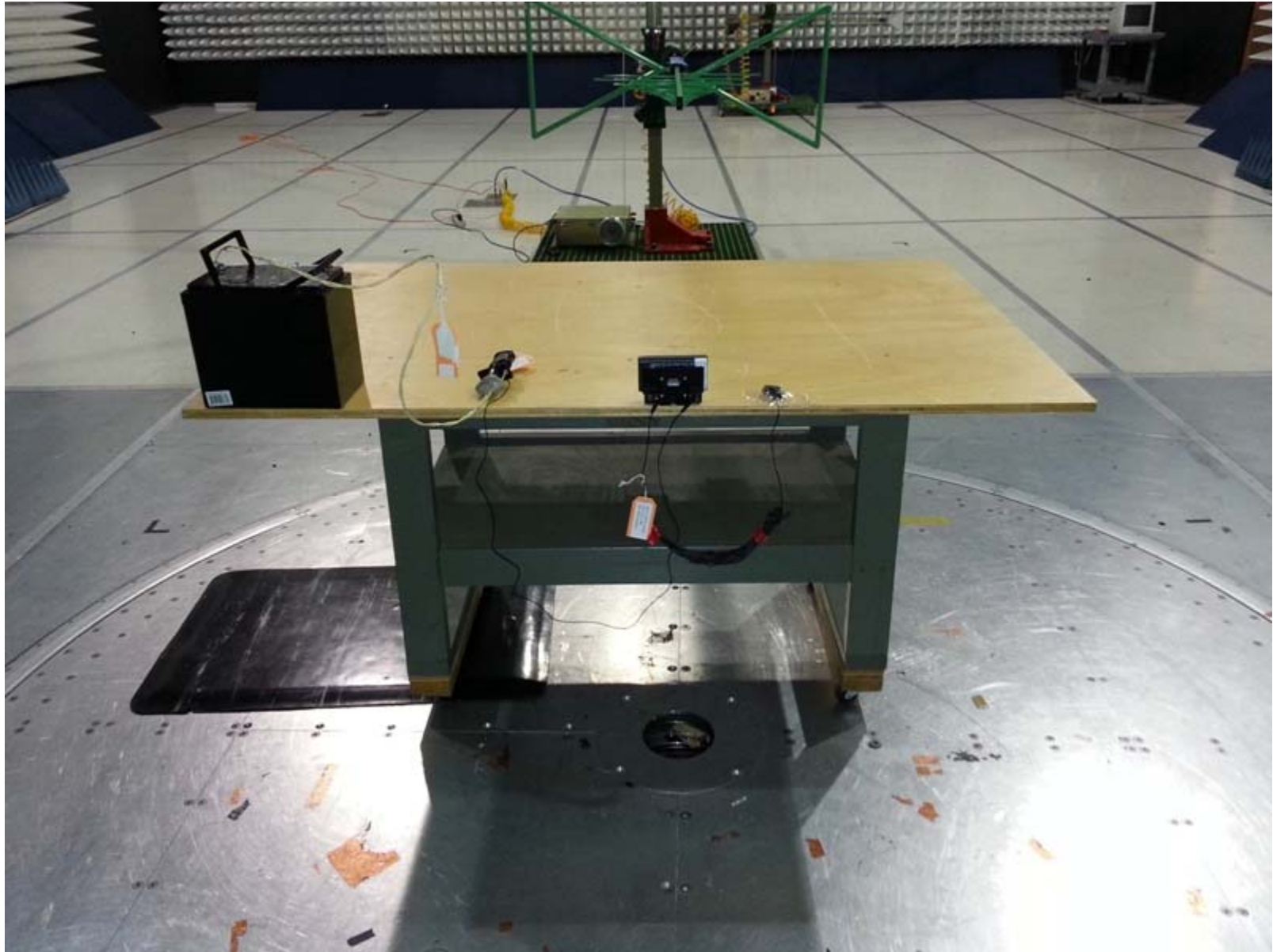
Radiated Emissions - Rear View