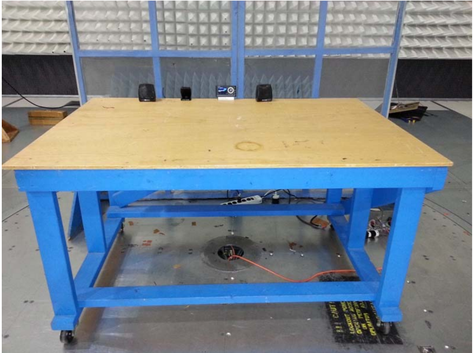
Conducted Emissions - Front View