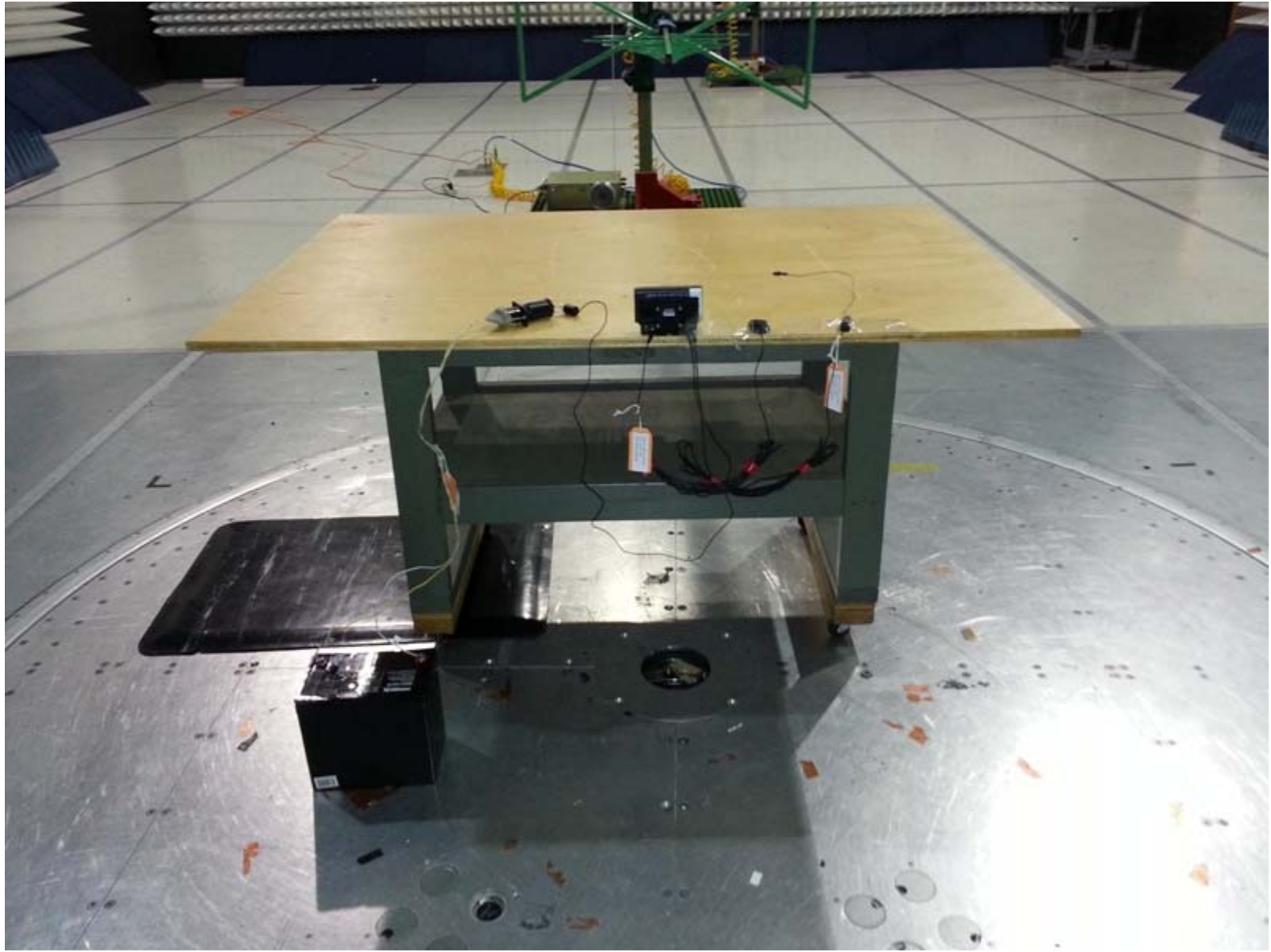
Radiated Emissions - Rear View