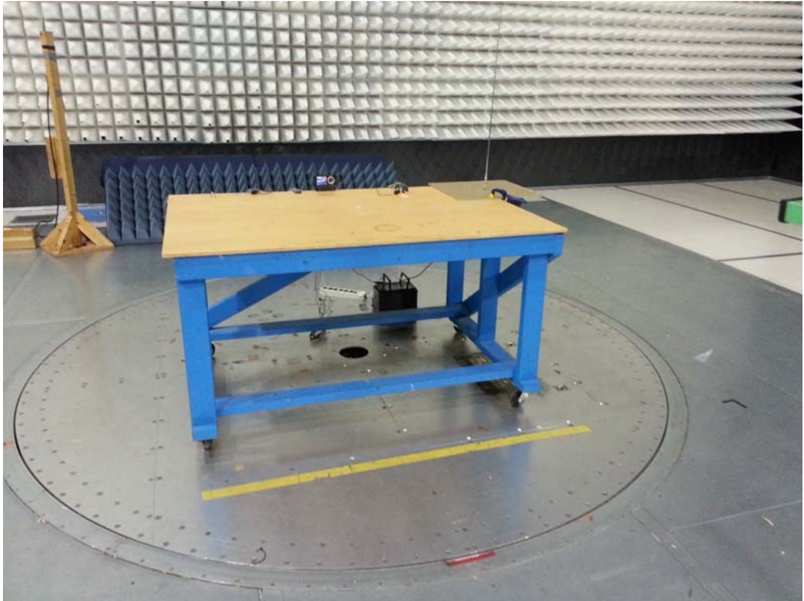
Radiated Emissions - Front View