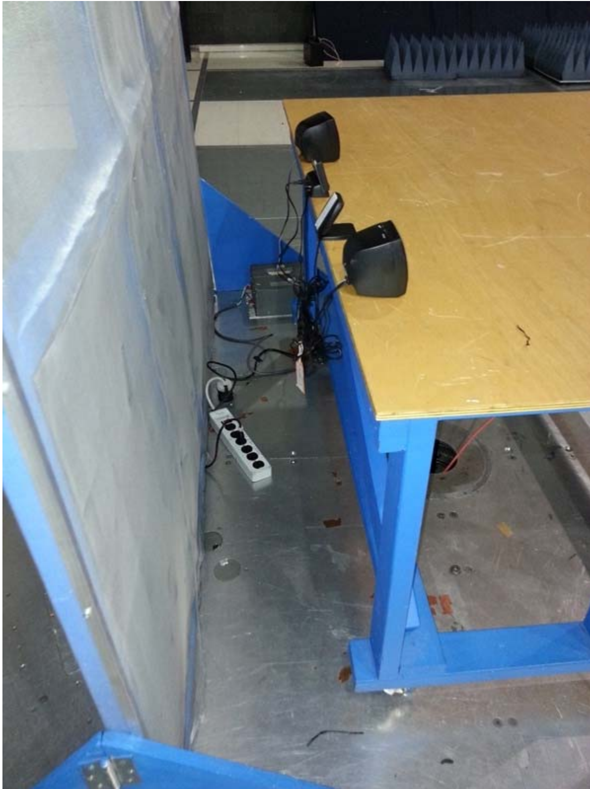
Conducted Emissions - Rear View