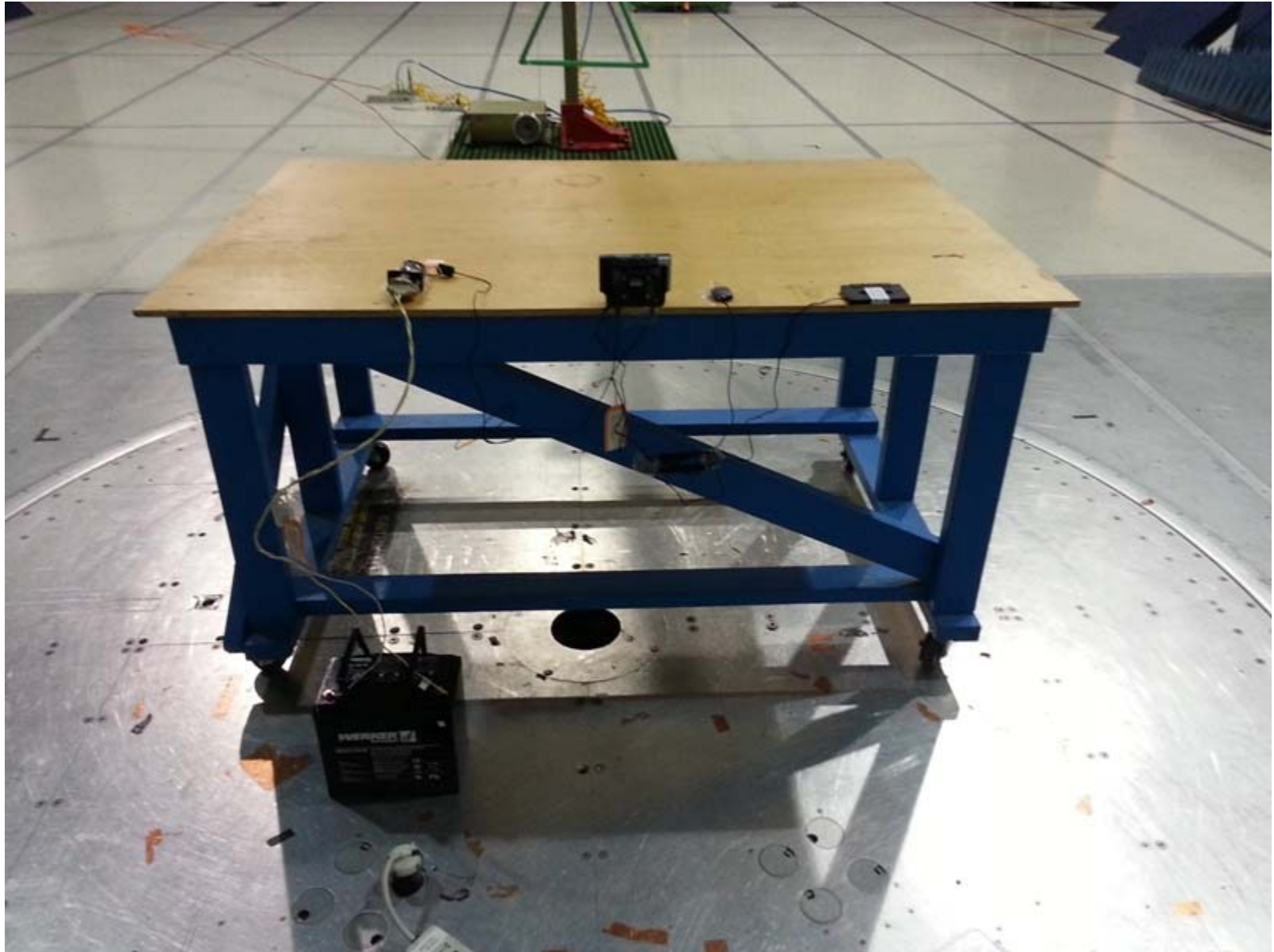
Radiated Emissions - Rear View