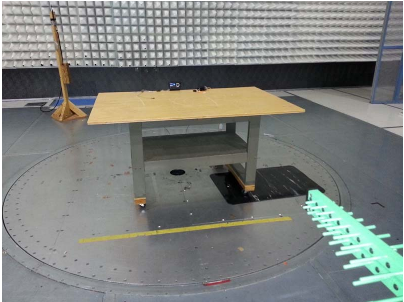
Radiated Emissions - Front View