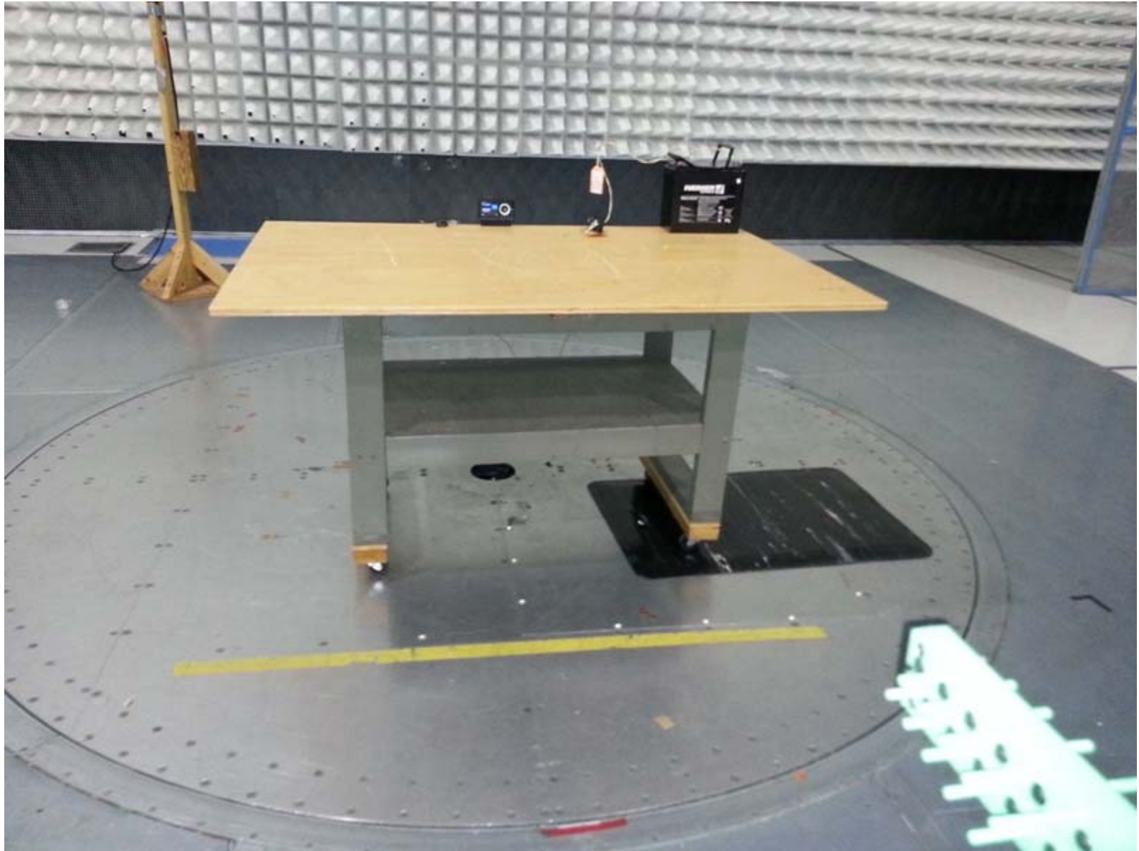
Radiated Emissions - Front View