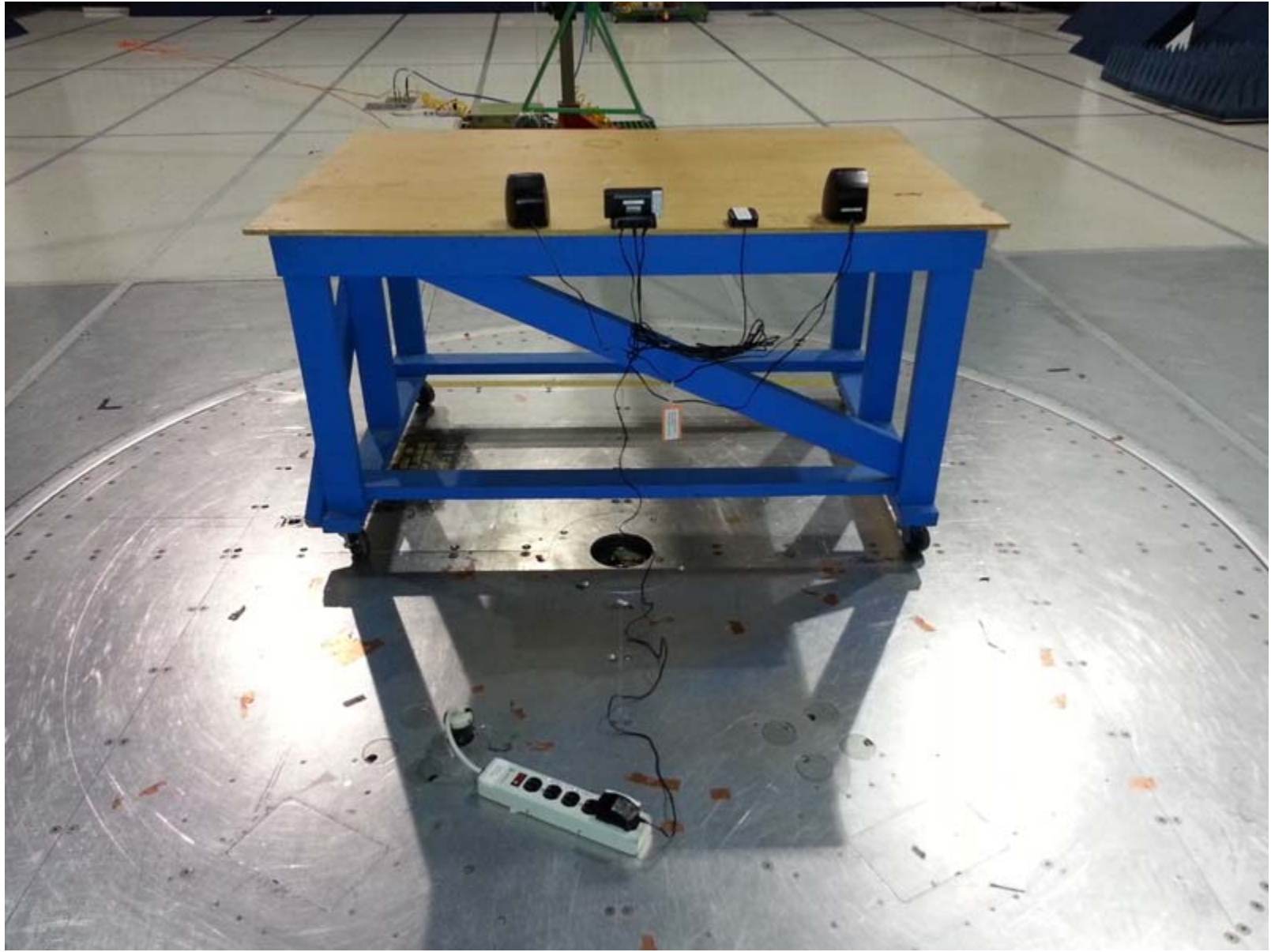
Radiated Emissions - Rear View