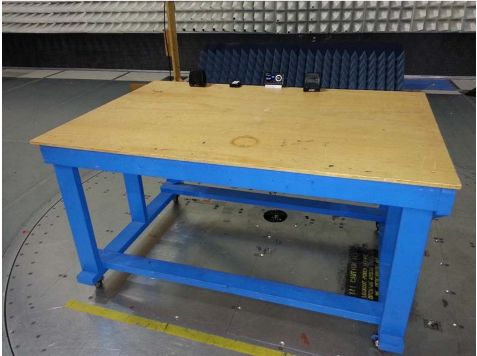
Radiated Emissions - Front View