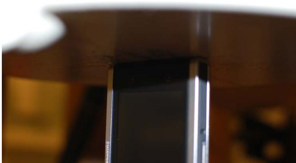
SAR Test Setup Photo 5 – Right at 0.0 cm