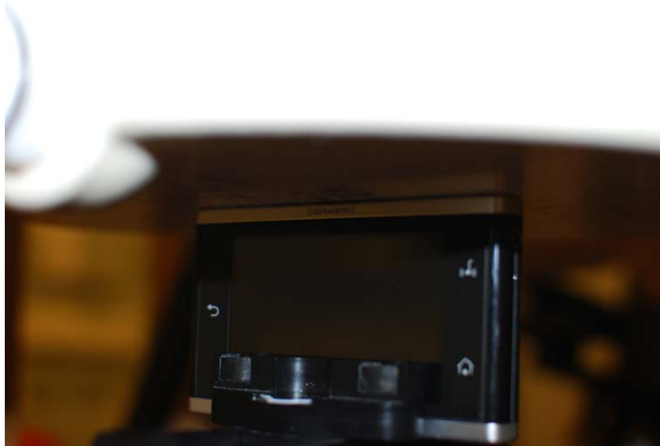
SAR Test Setup Photo 3 – Top at 0.0 cm