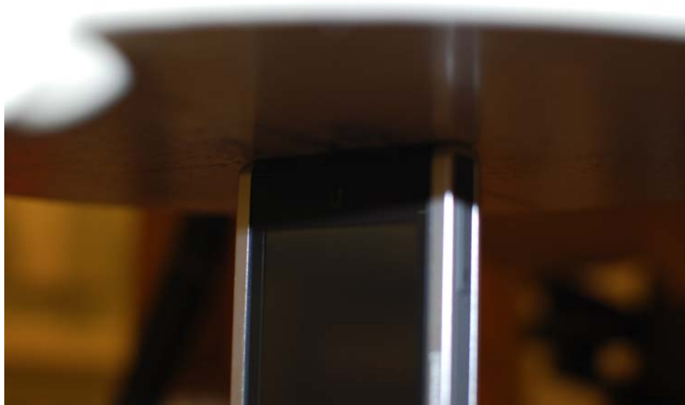
SAR Test Setup Photo 6 – Left at 0.0 cm