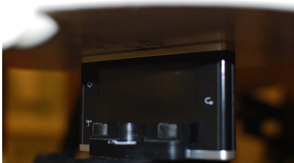
SAR Test Setup Photo 4 – Bottom at 0.0 cm