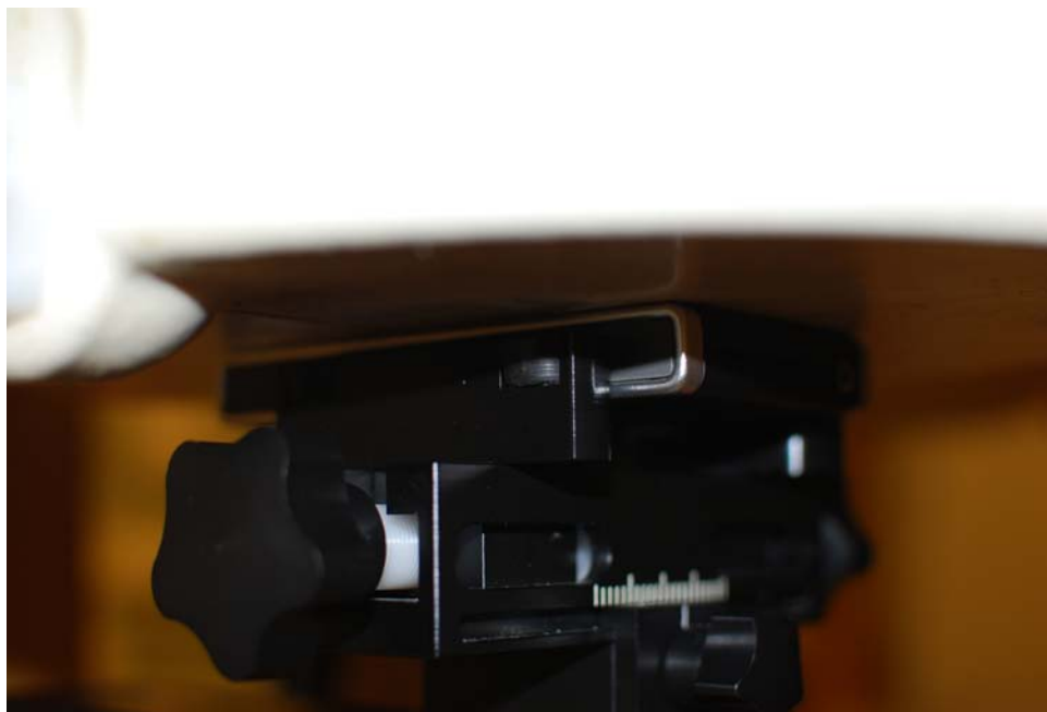
SAR Test Setup Photo 2 – Front at 0.0 cm