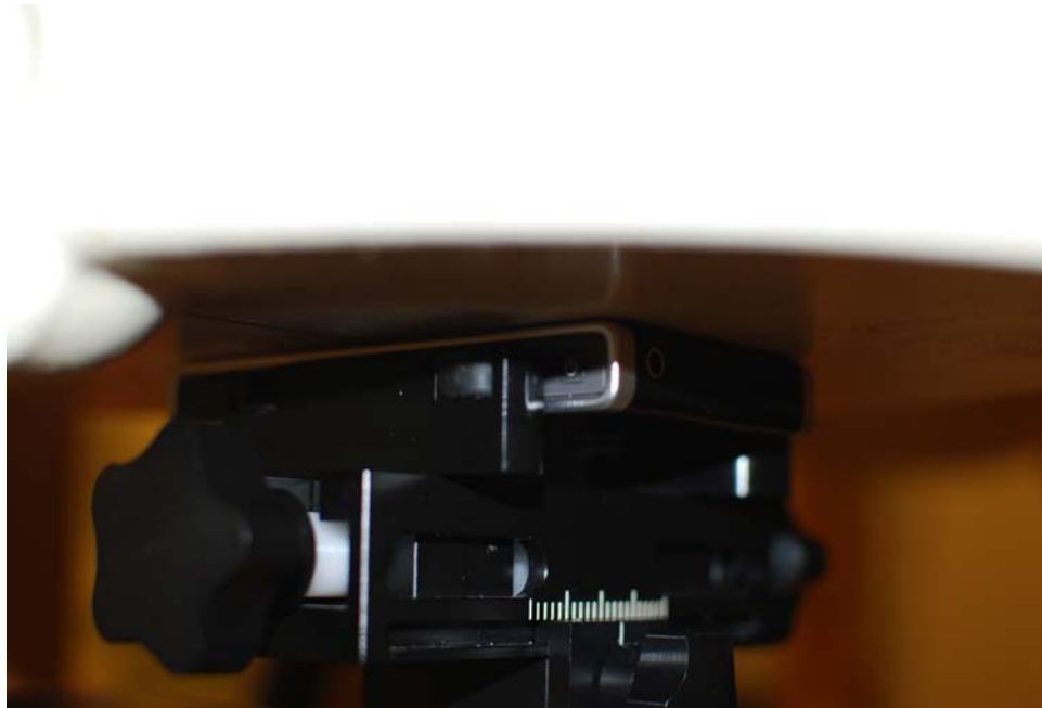
SAR Test Setup Photo 1 – Back at 0.0 cm