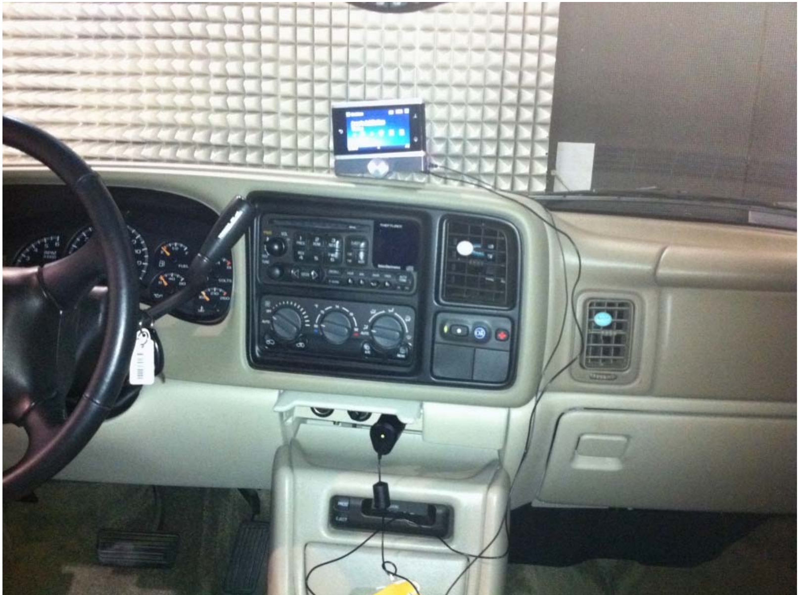
Large Vehicle - Internal View