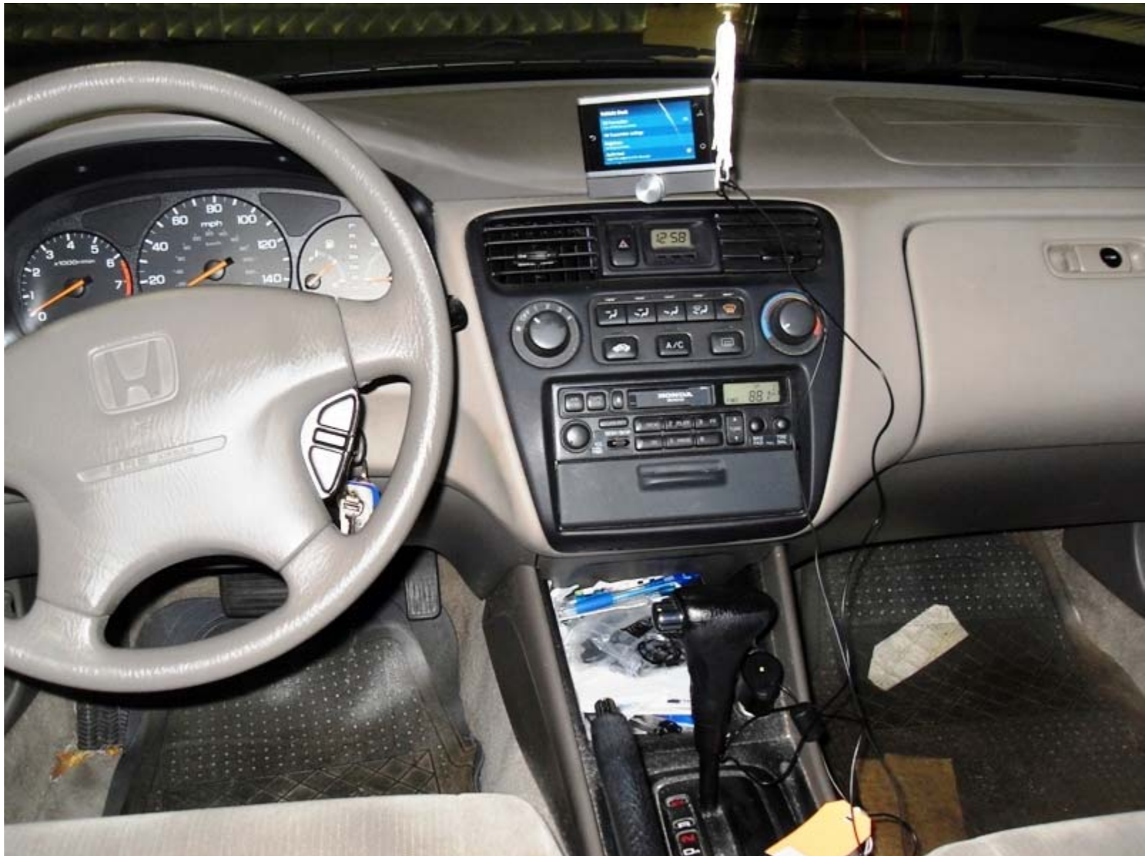
Medium Vehicle - Internal View