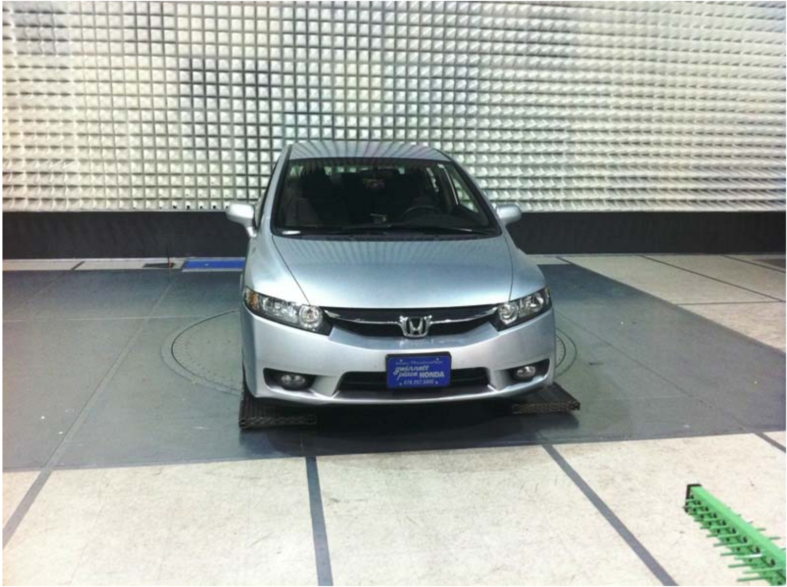
Small Vehicle - Front View