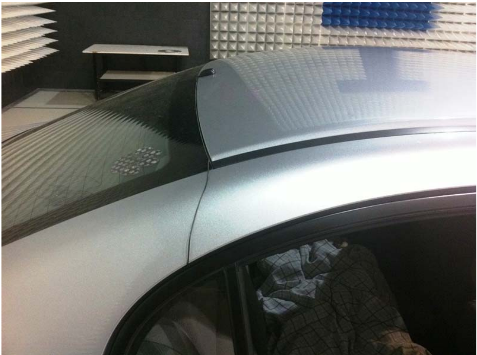
Small Vehicle - Rear View (Antenna Location)