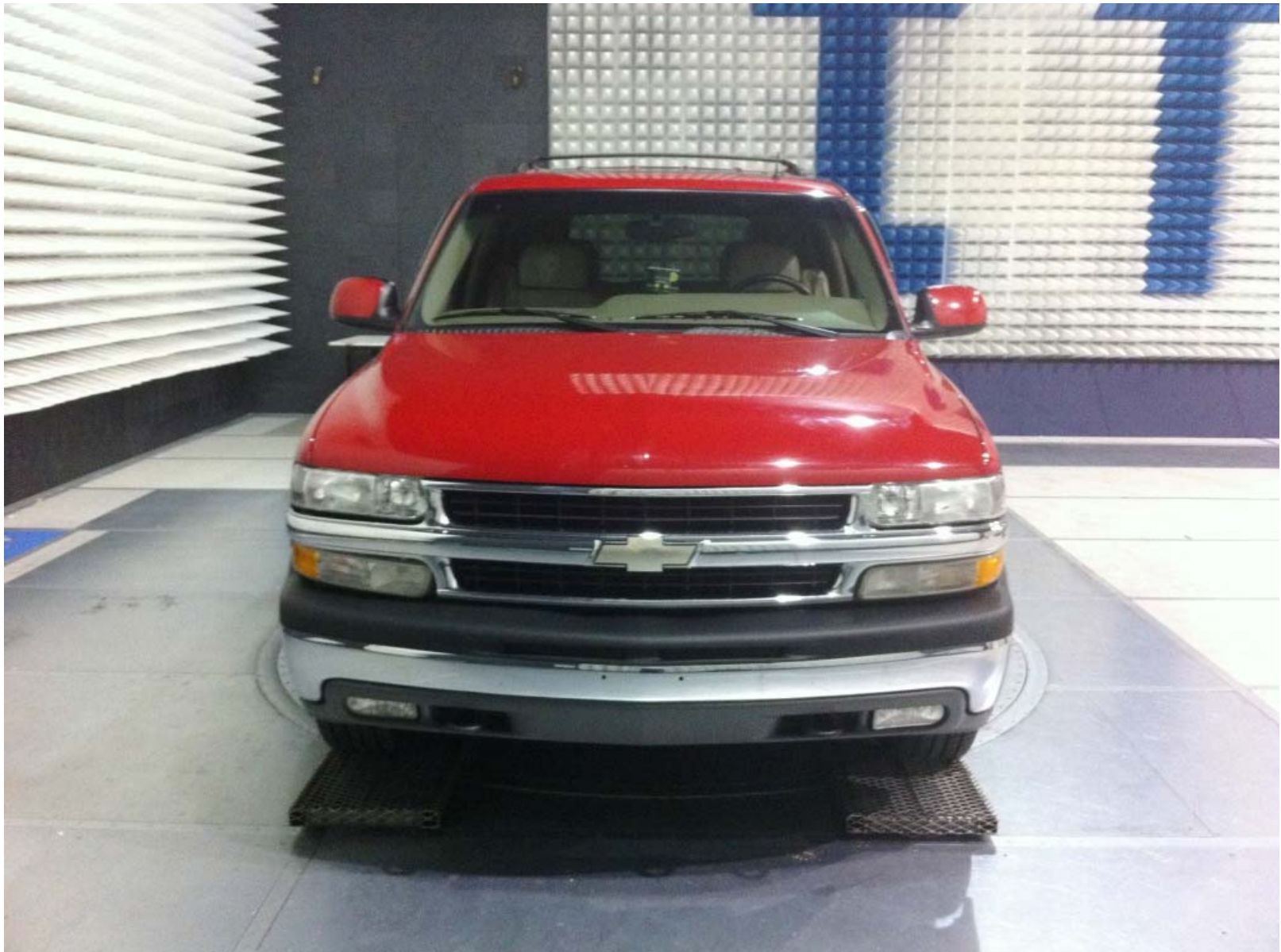
Large Vehicle - Front View