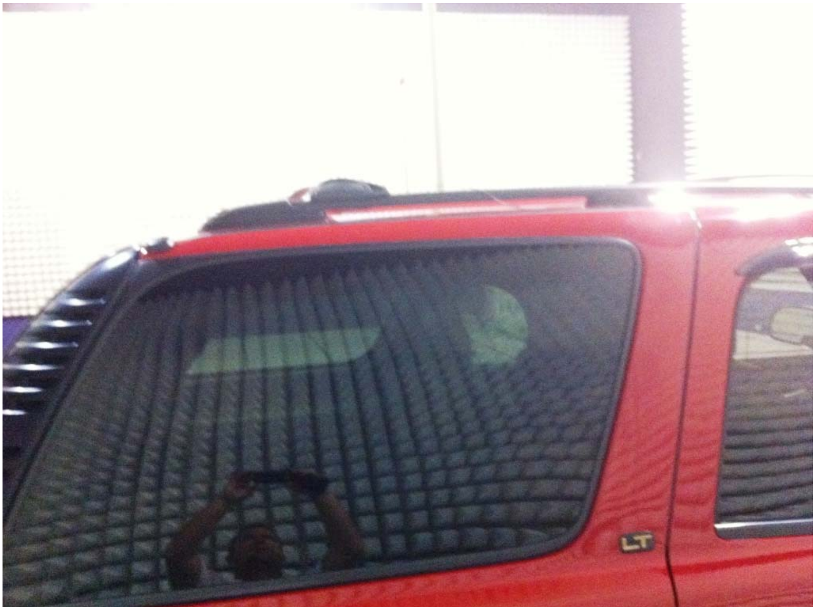
Large Vehicle - Rear View (Antenna Location)