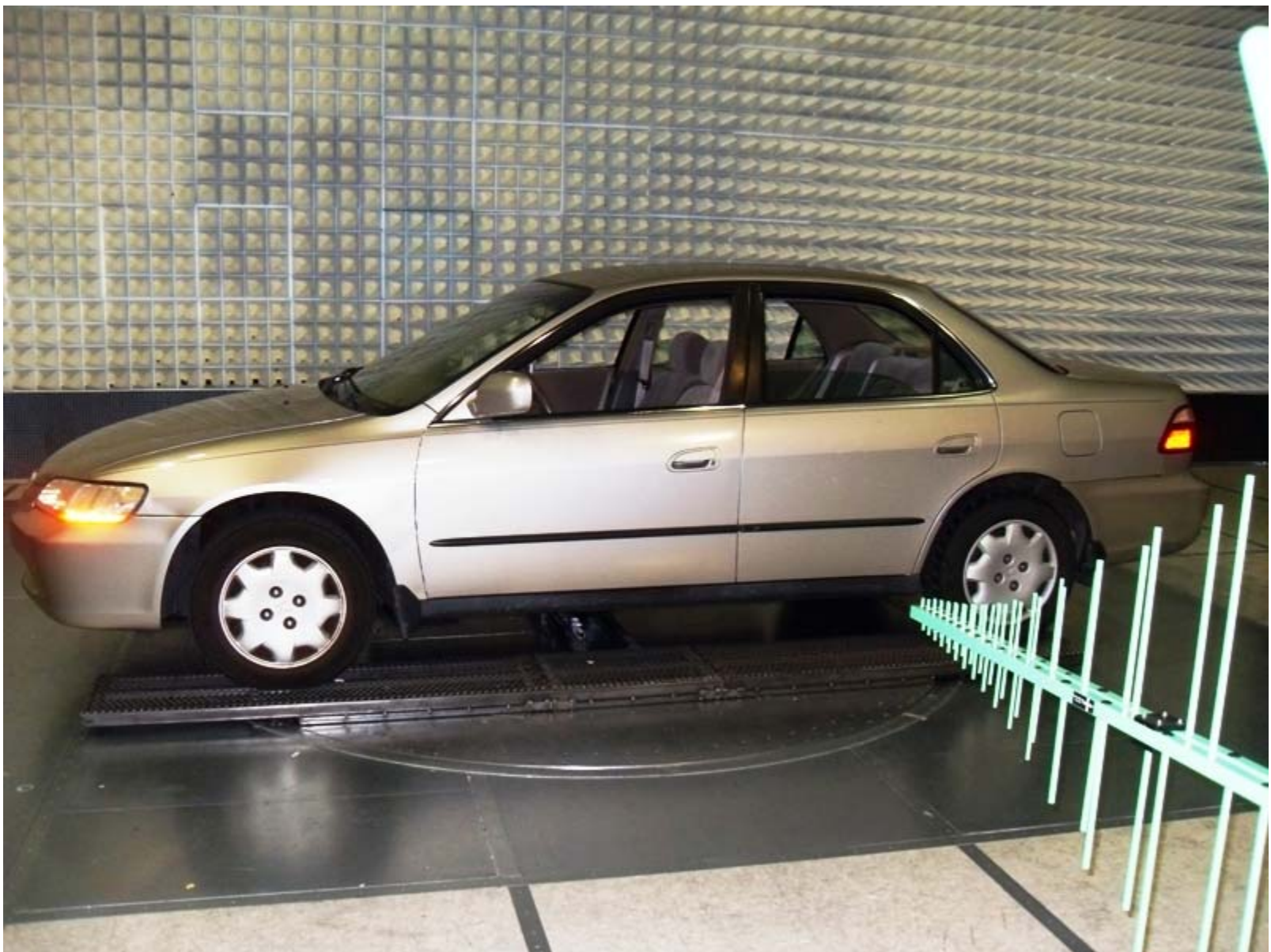
Medium Vehicle - Left View