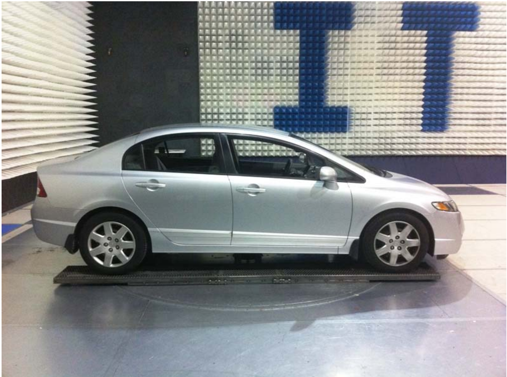
Small Vehicle - Right View