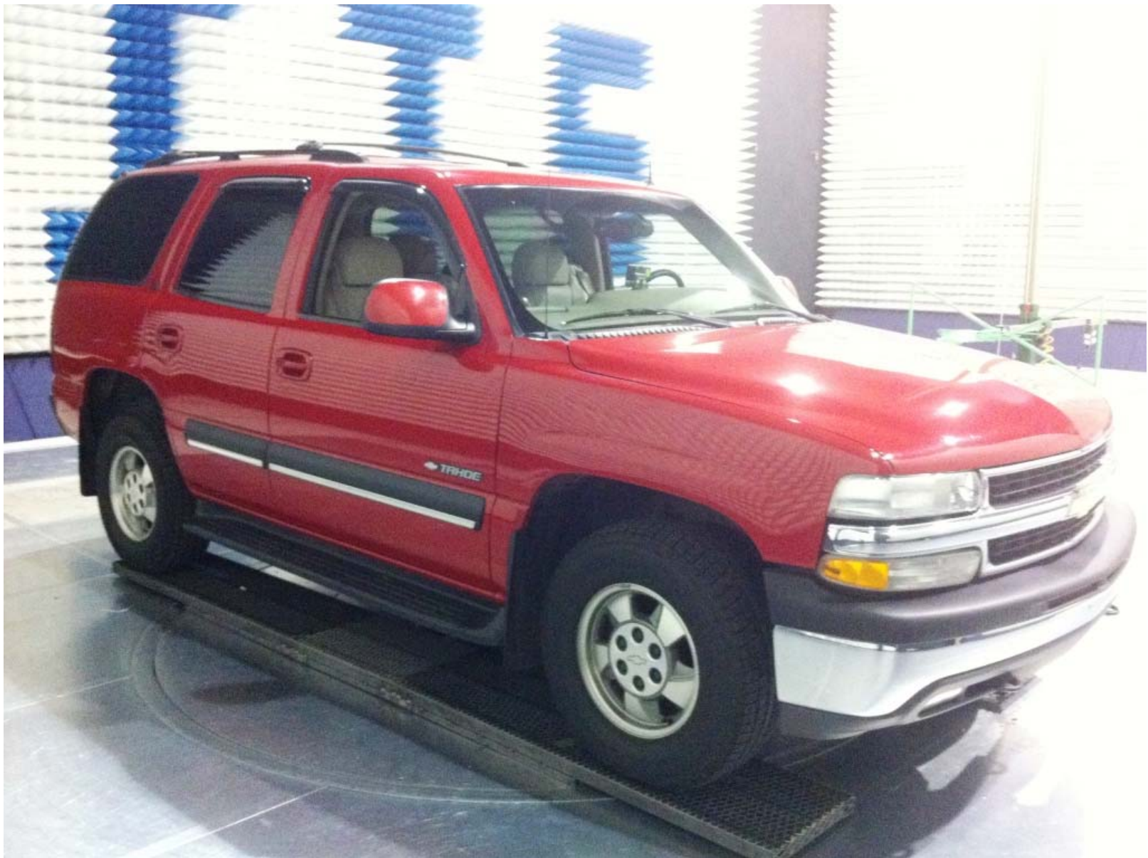
Large Vehicle - Right View