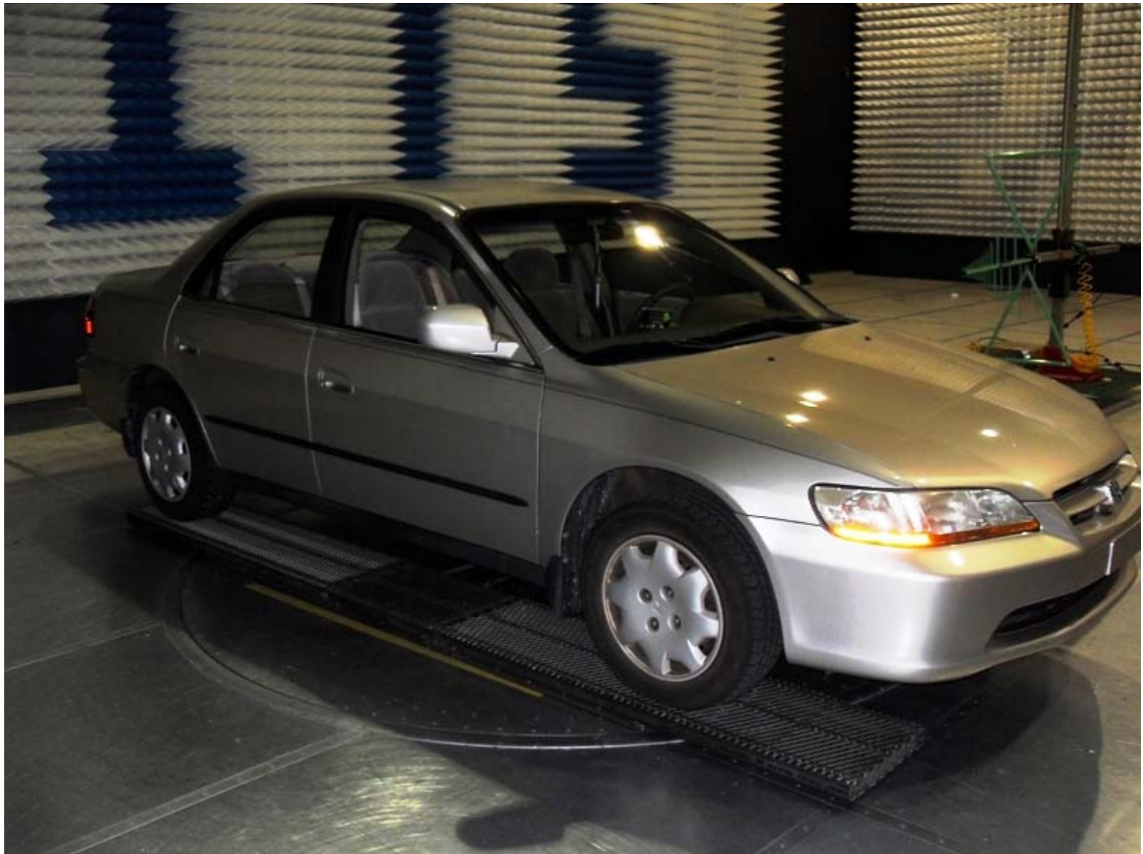
Medium Vehicle - Right View