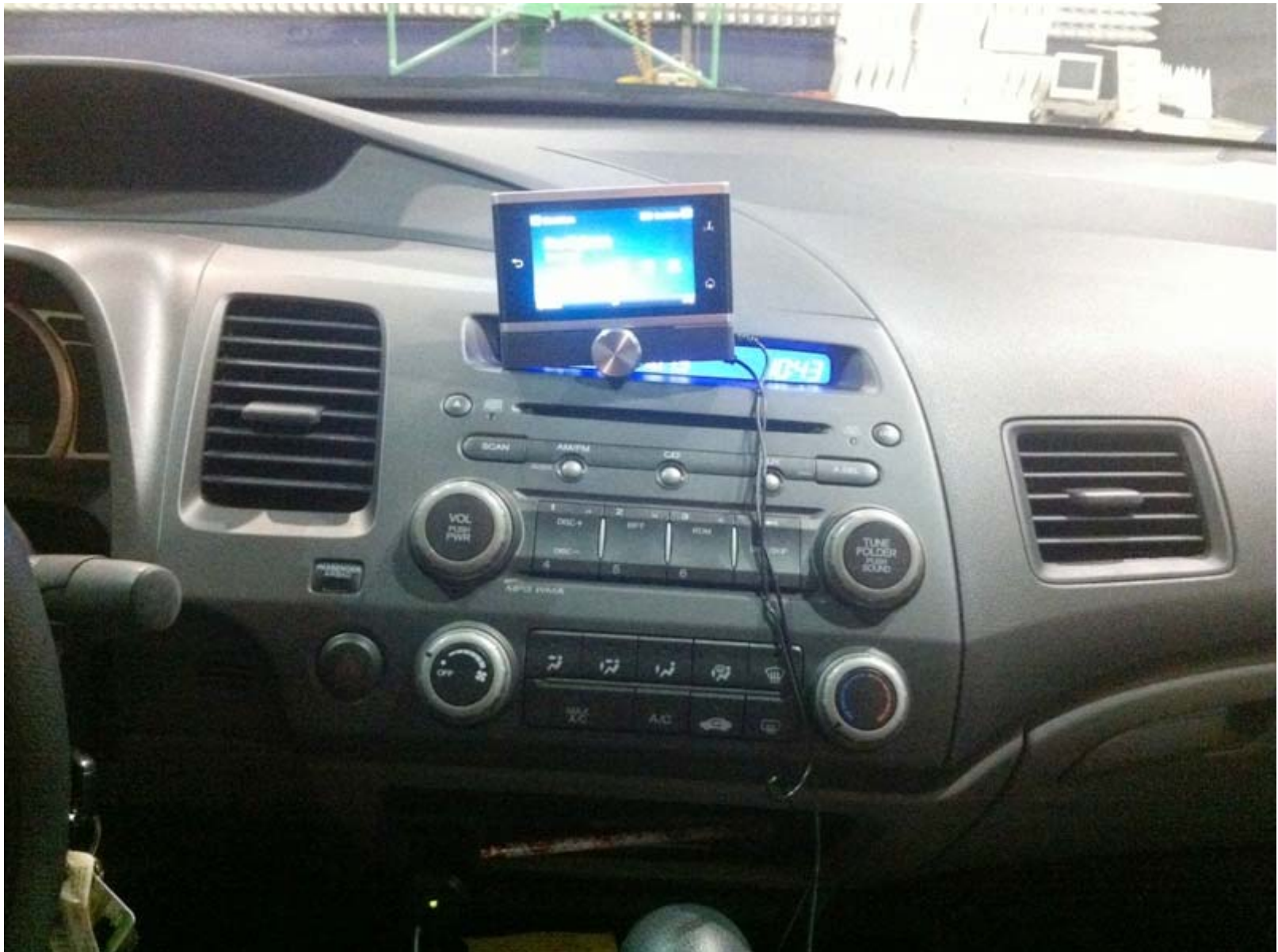
Small Vehicle - Internal View