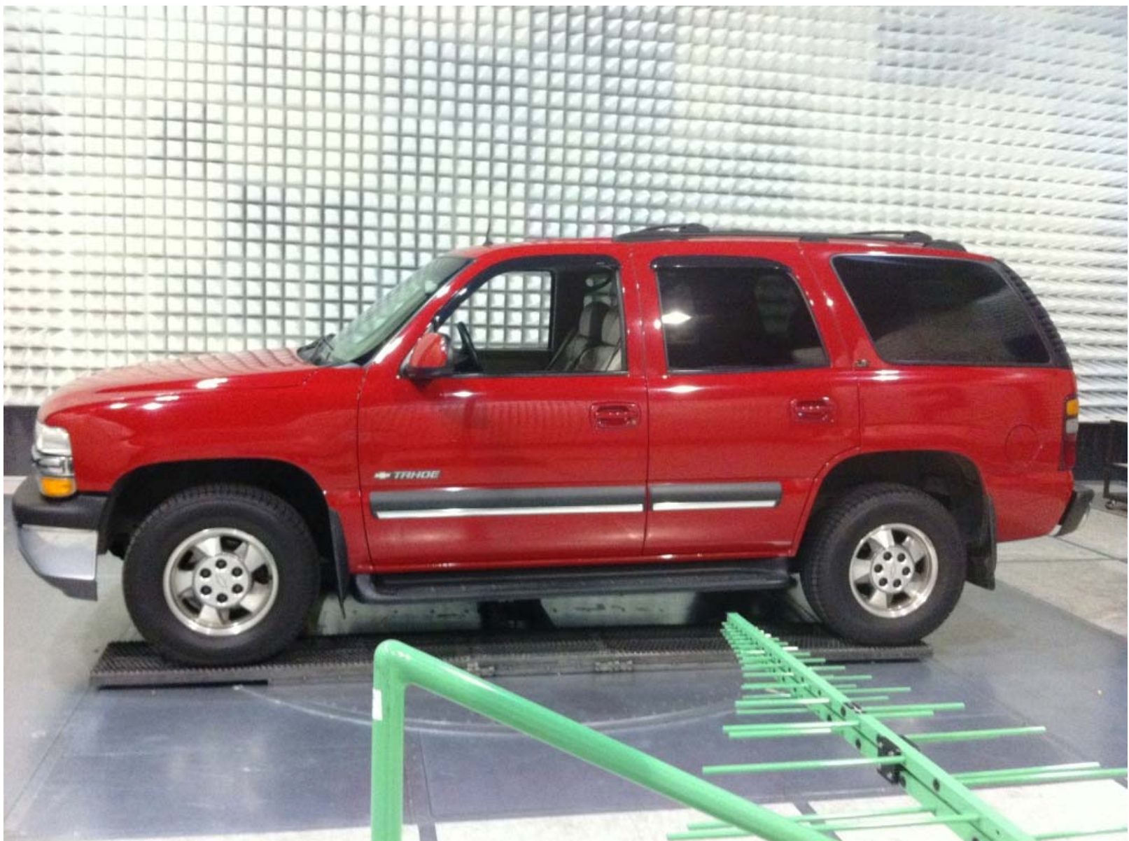
Large Vehicle - Left View