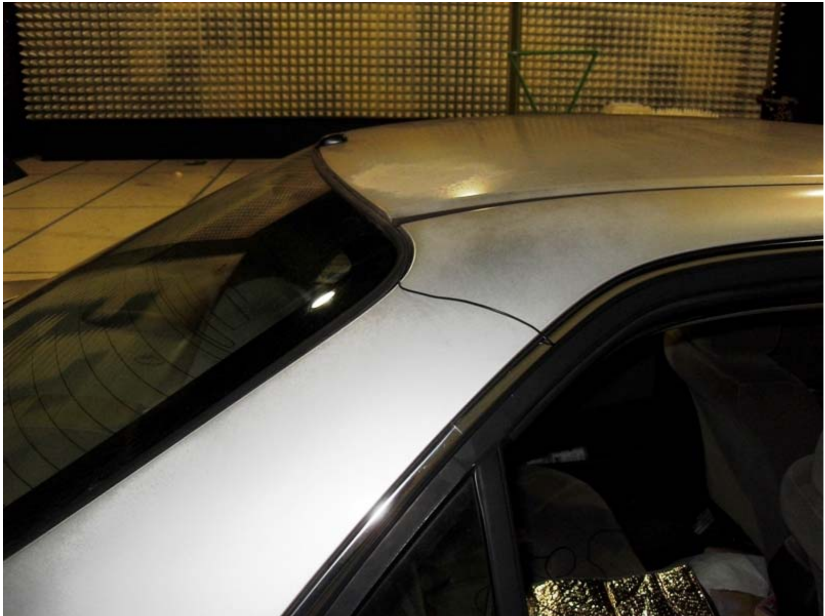
Medium Vehicle - Rear View (Antenna Location)