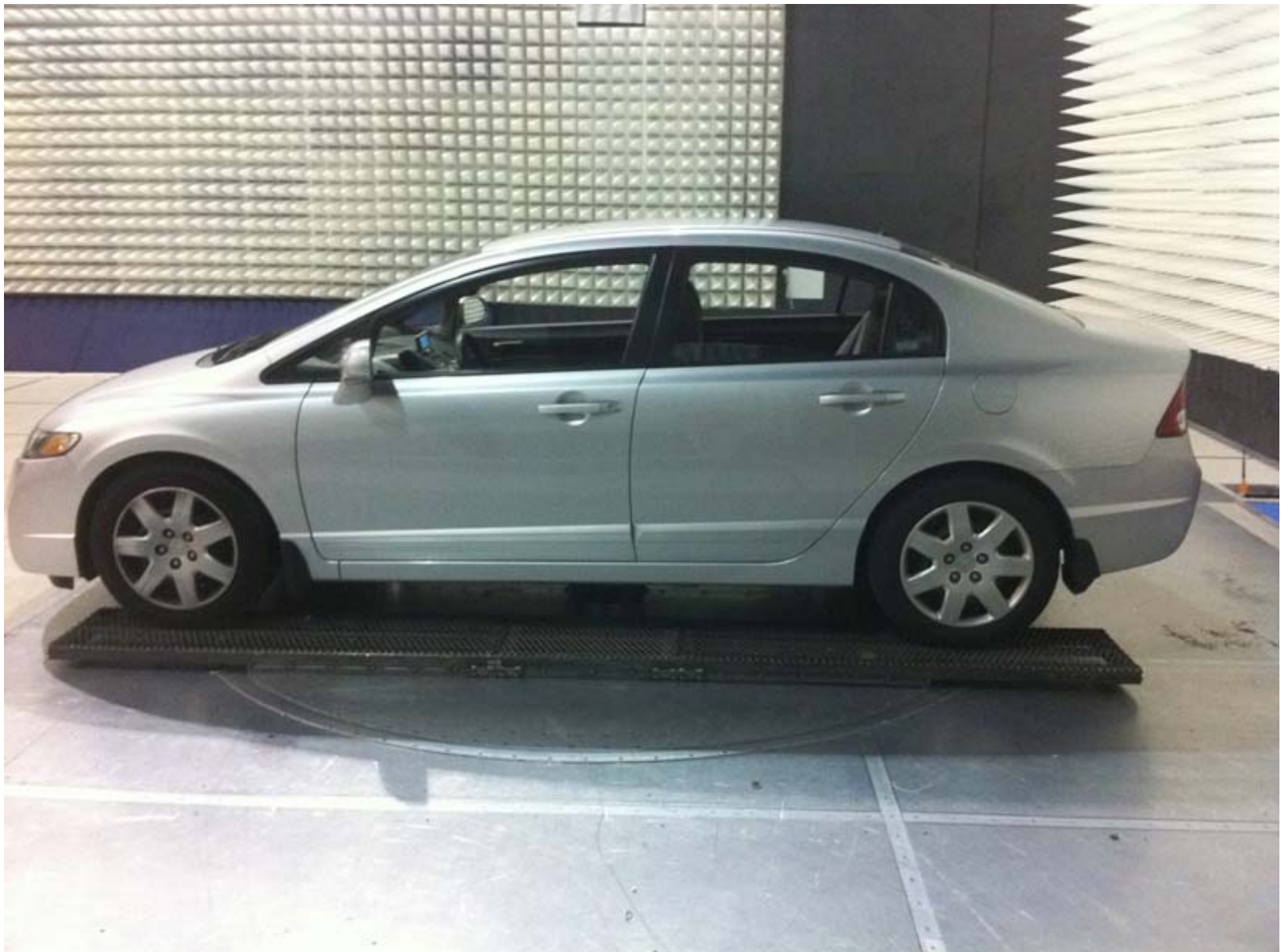
Small Vehicle - Left View