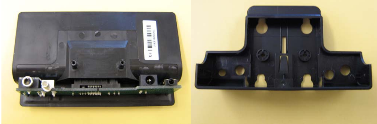
Front and Rear Housing with PCBA