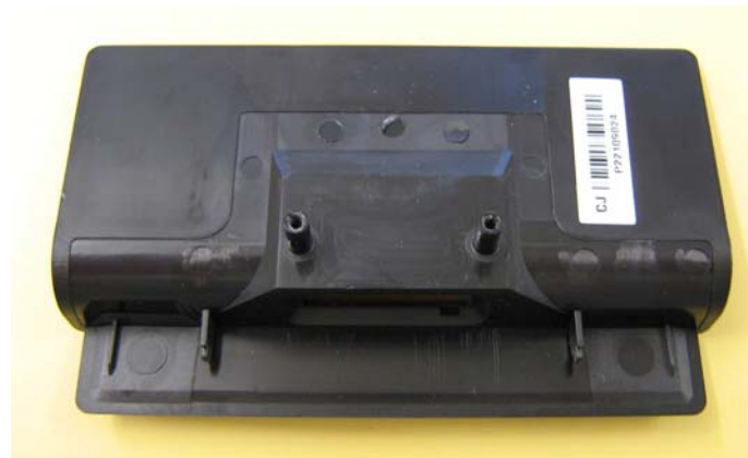
Front Housing without PCBA