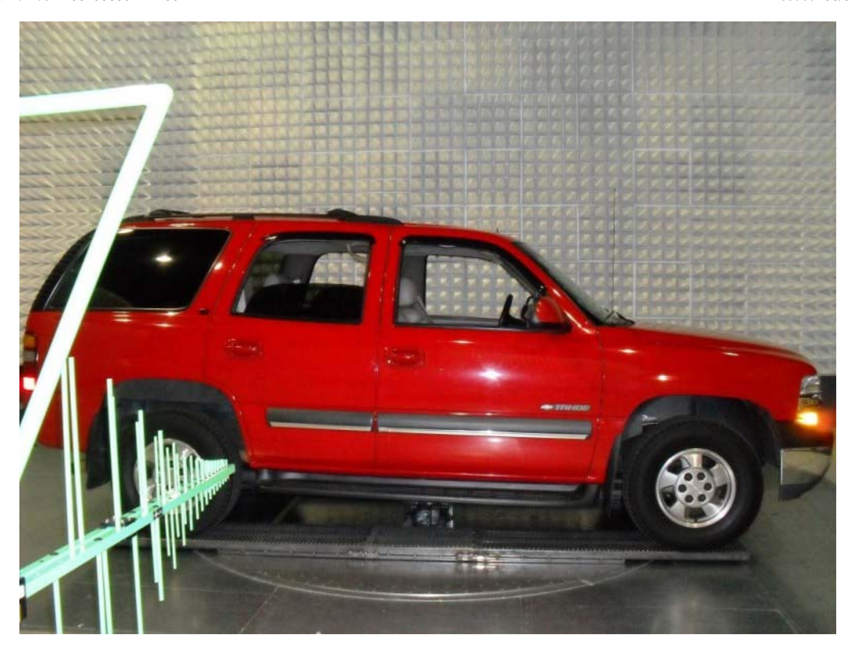
Large Vehicle - Right View