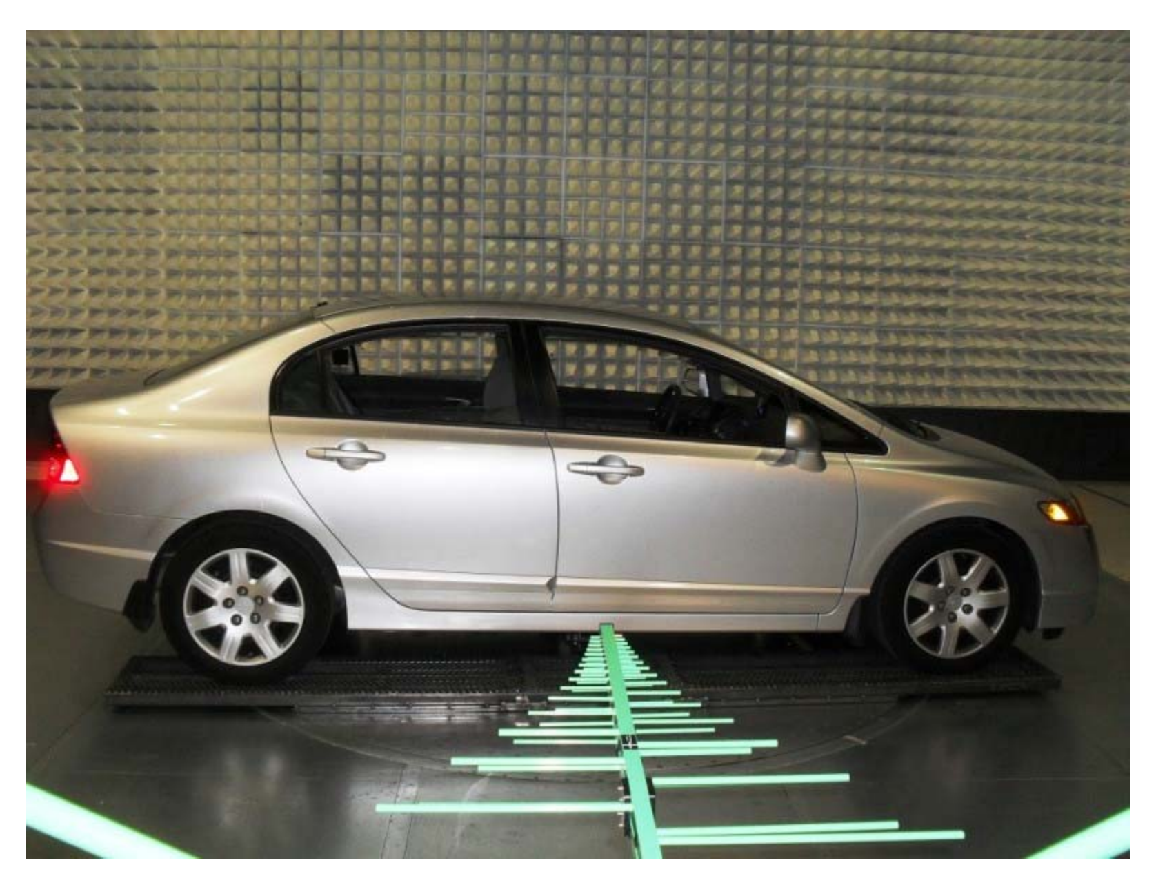
Small Vehicle - Right View