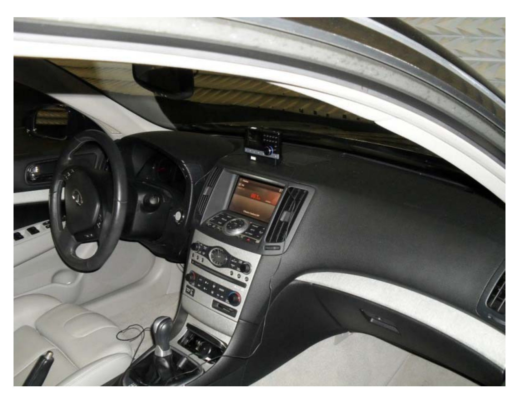
Medium Vehicle - Internal View