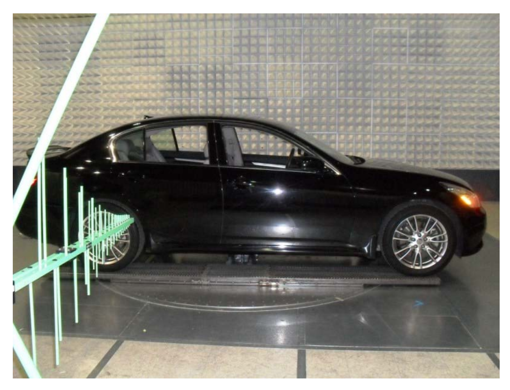
Medium Vehicle - Right View