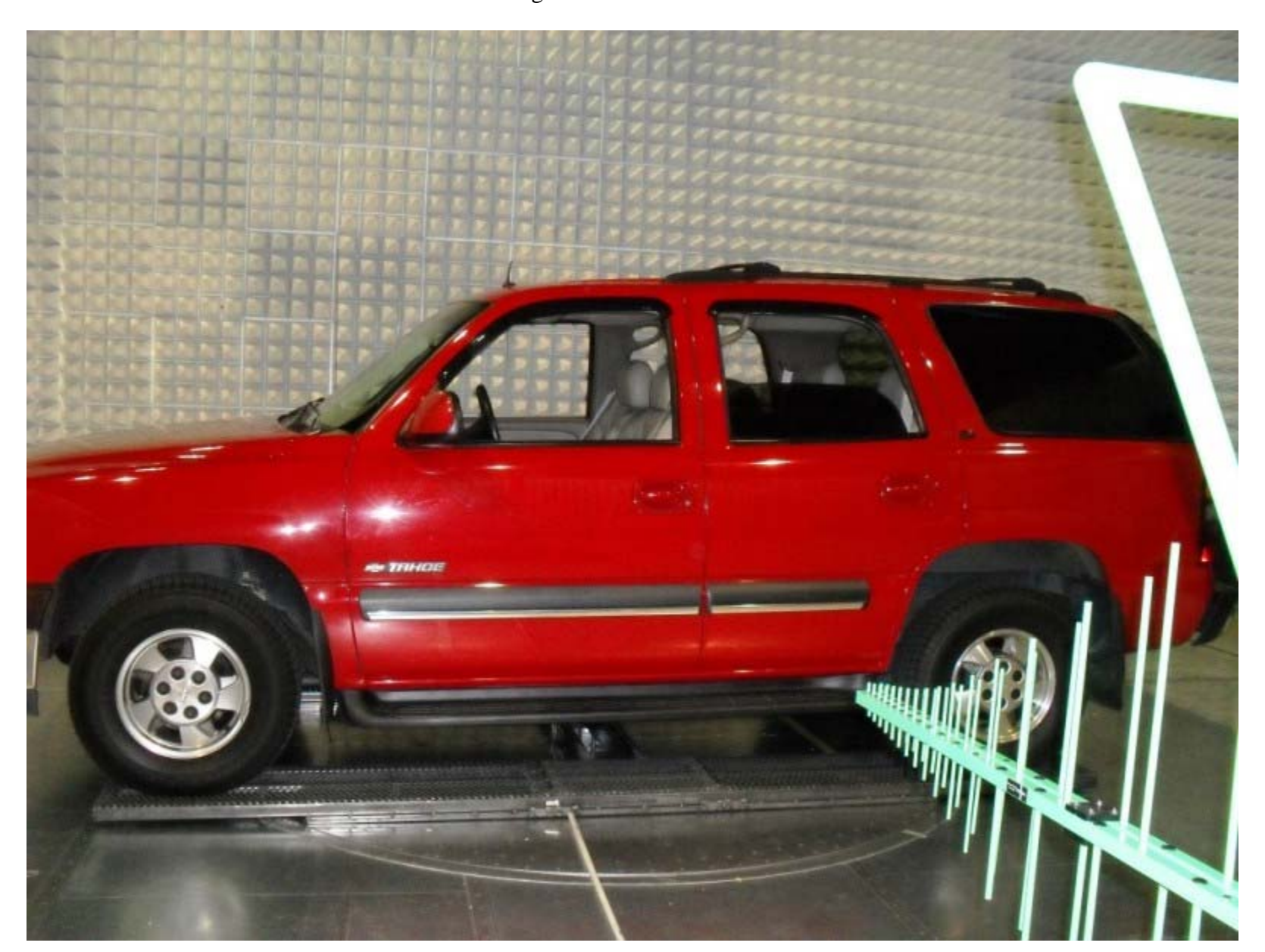
Large Vehicle - Left View