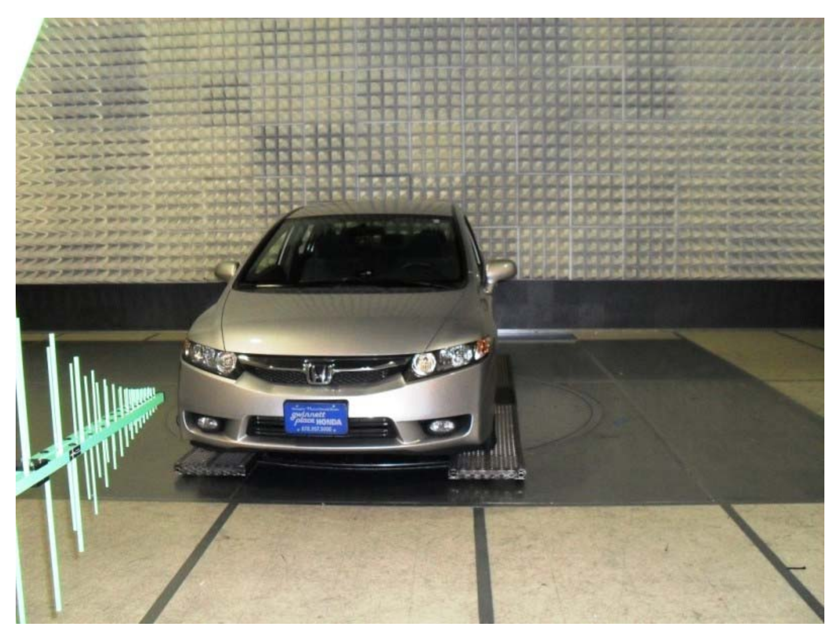
Small Vehicle - Front View