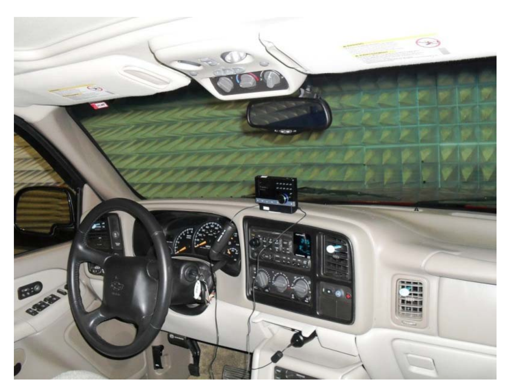
Large Vehicle - Internal View