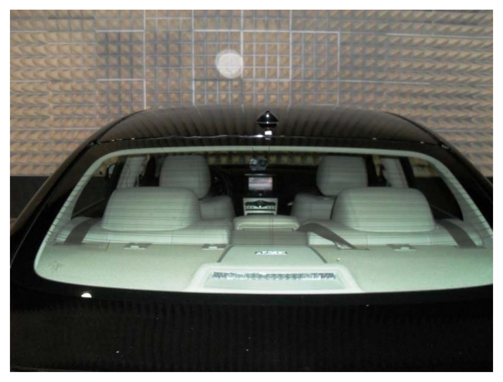
Medium Vehicle - Rear View (Antenna Location)