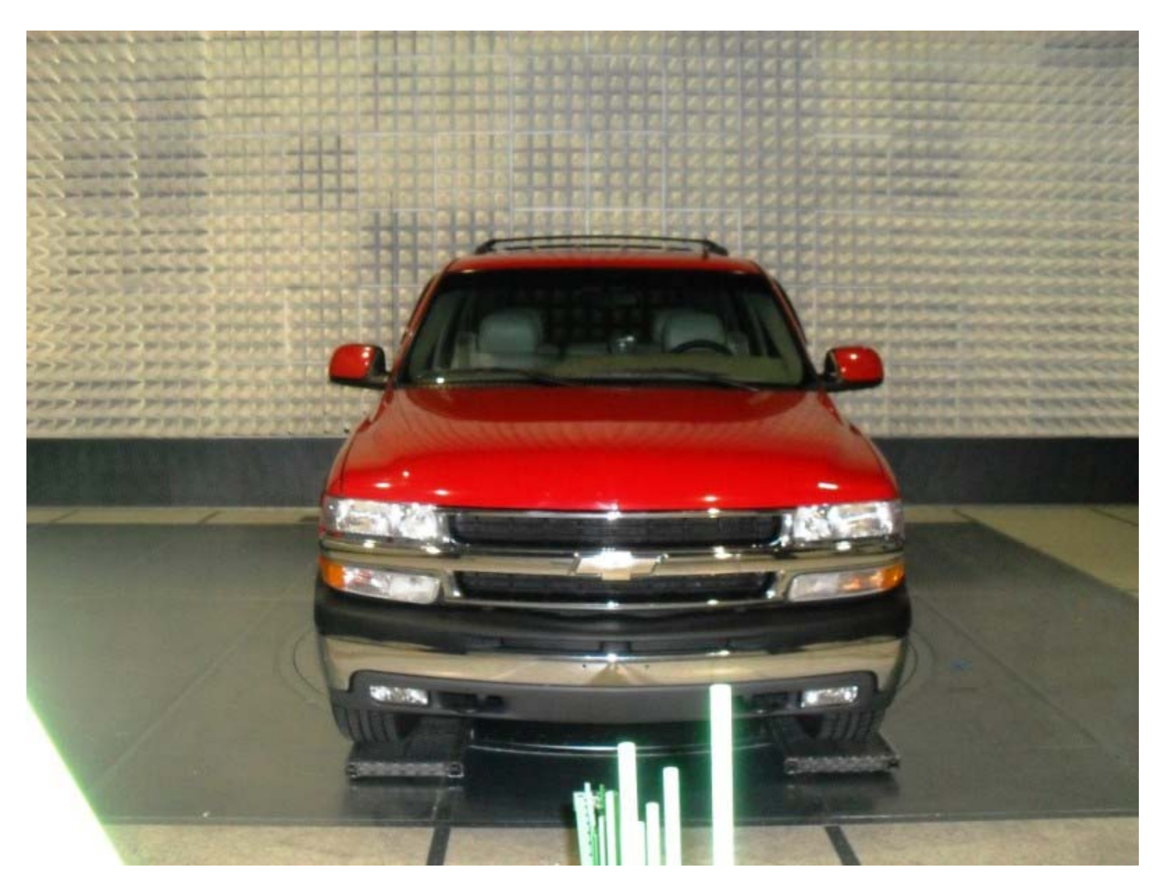
Large Vehicle - Front View