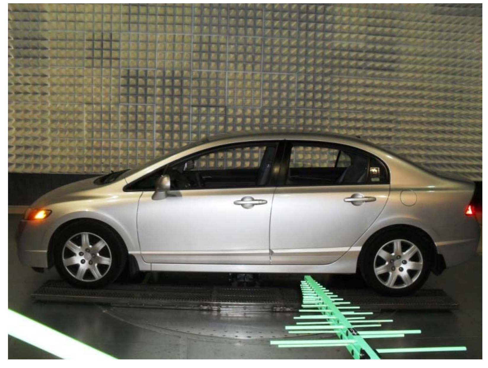
Small Vehicle - Left View