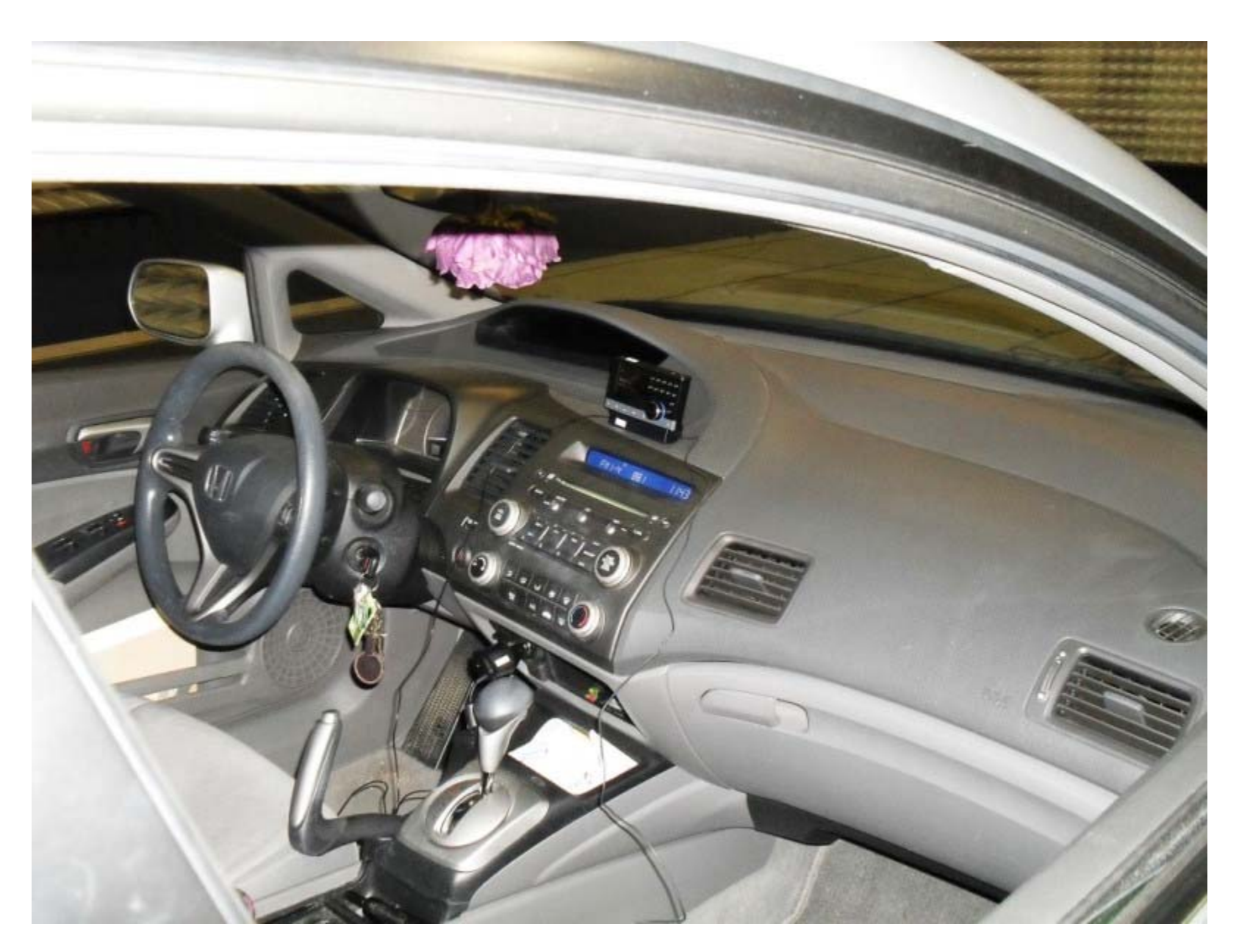
Small Vehicle - Internal View