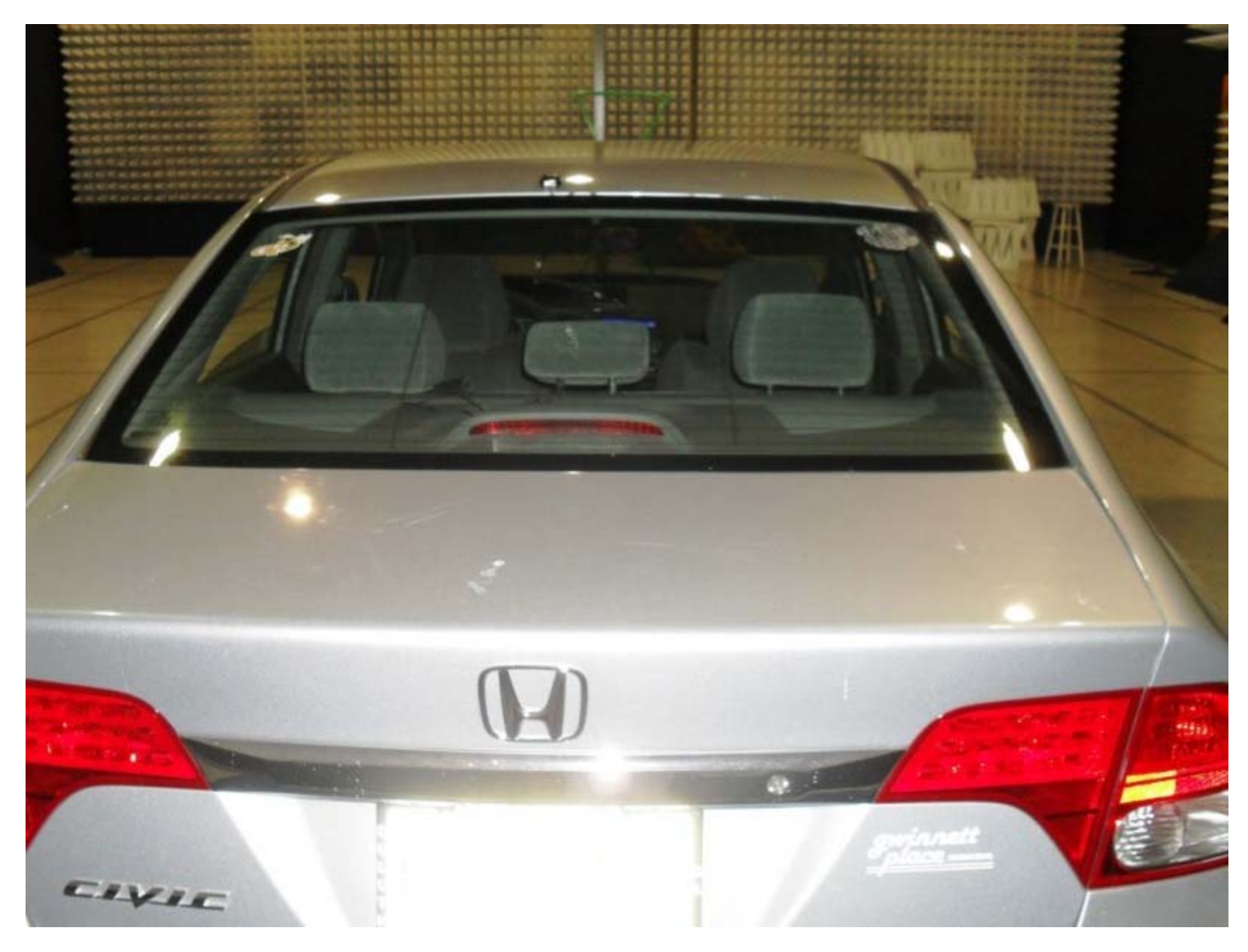
Small Vehicle - Rear View (Antenna Location)