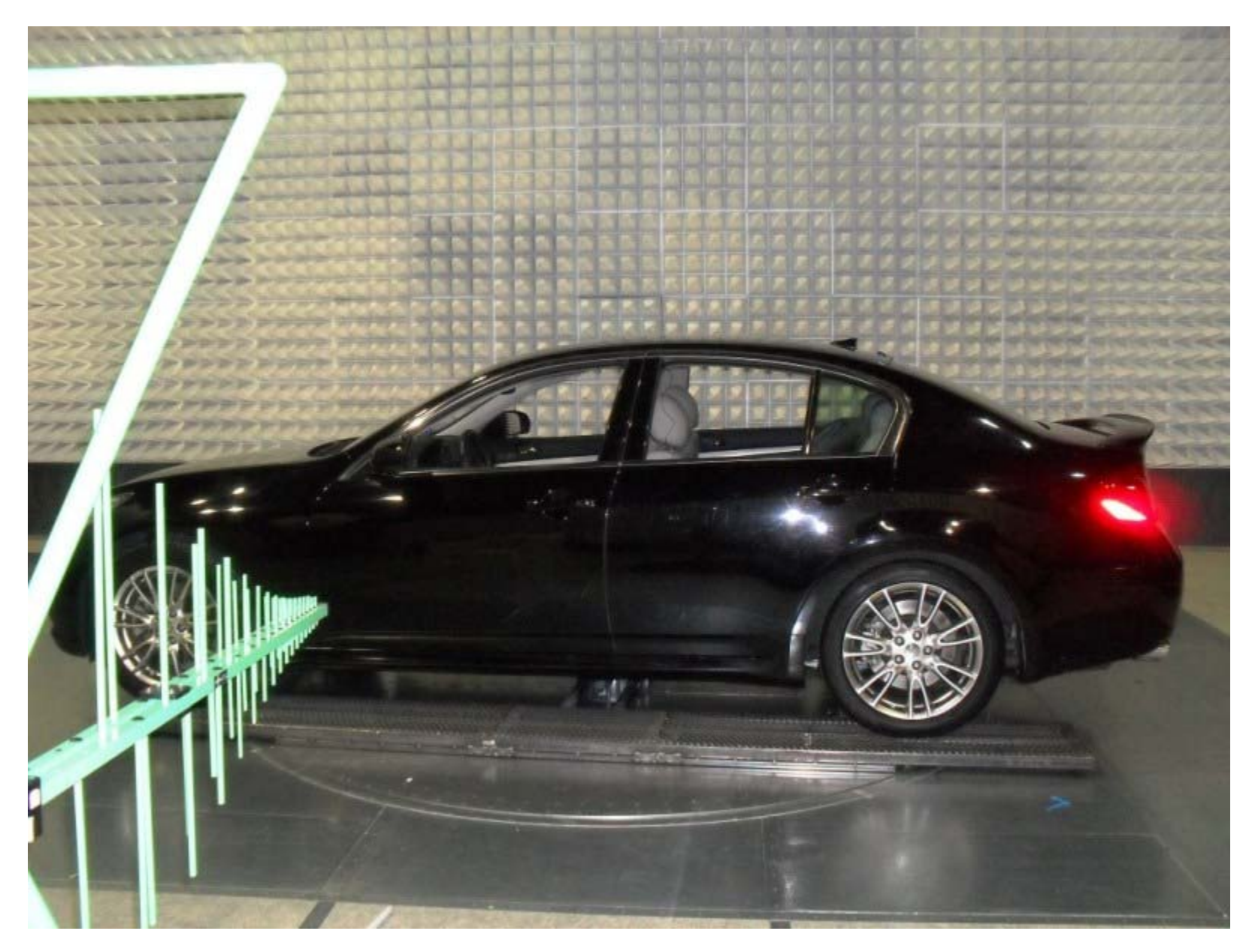
Medium Vehicle - Left View