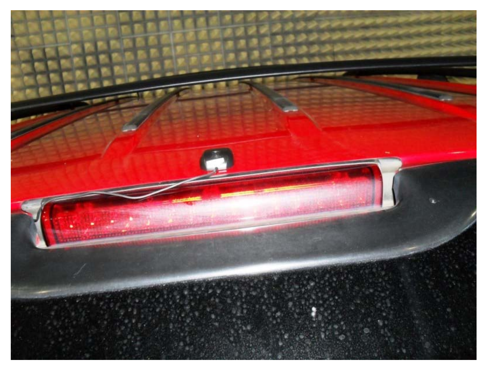
Large Vehicle - Rear View (Antenna Location)