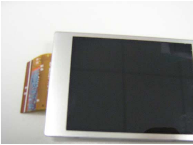
Front View of LCM