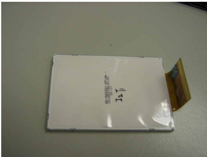
Bottom View of LCM