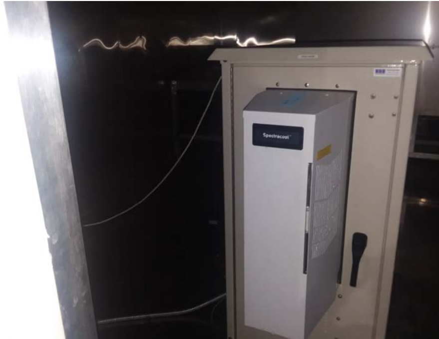
Photograph 1. Frequency Stability, Test Setup