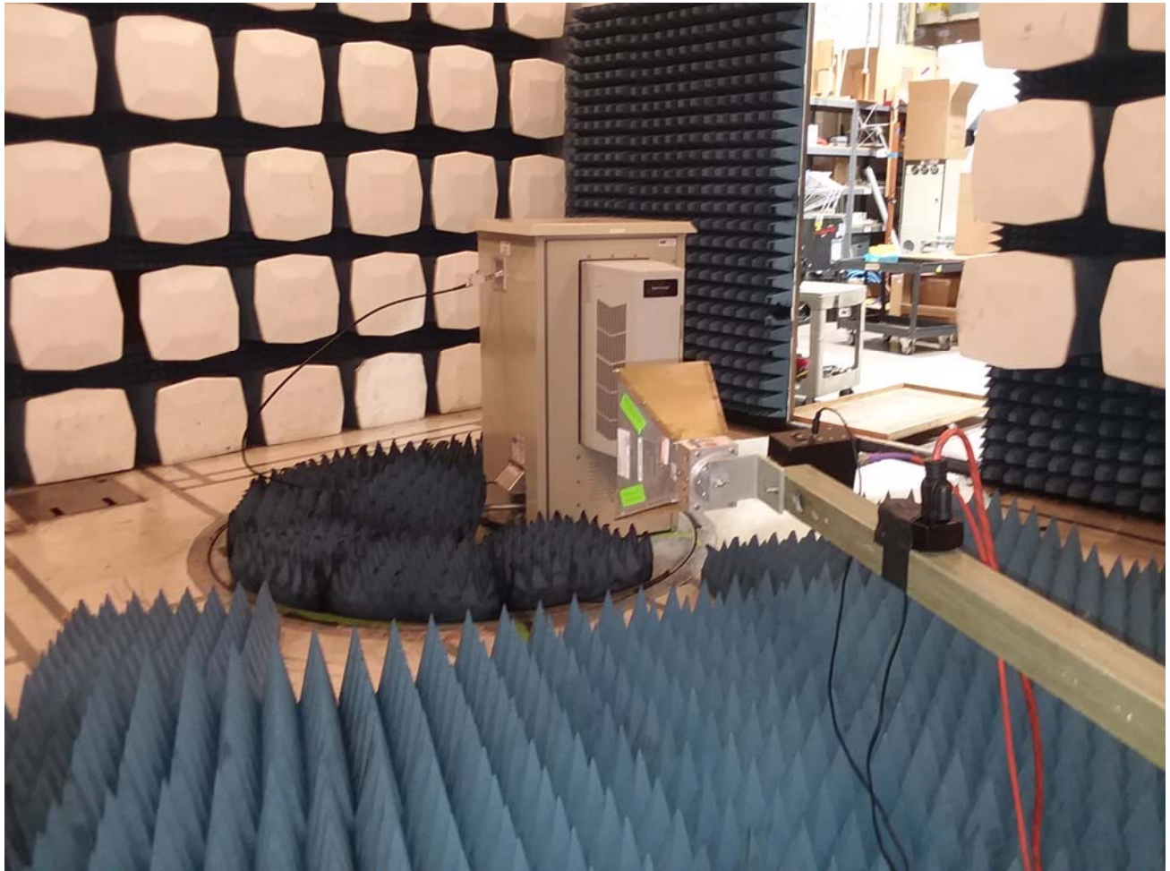
Photograph 3. Cabinet Spurious Radiation, Test Setup 2