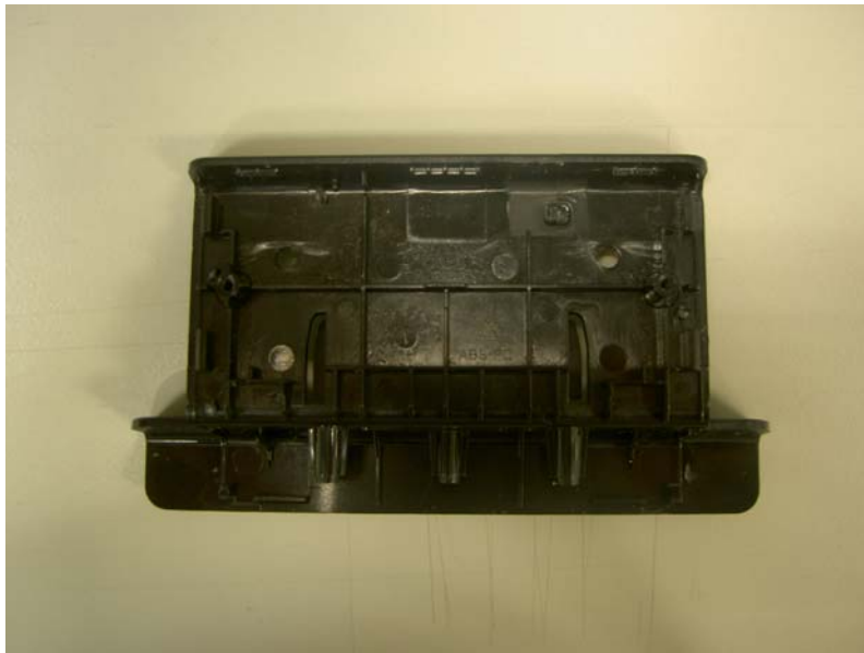
Front Housing without PCBA