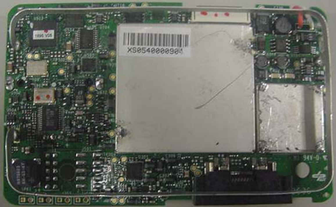
Back of PCB