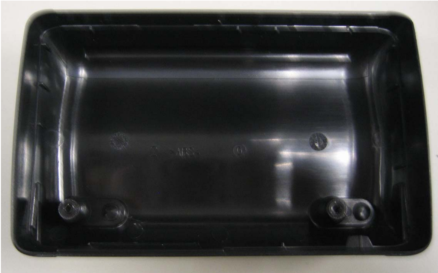
Case Open with PCBs Removed