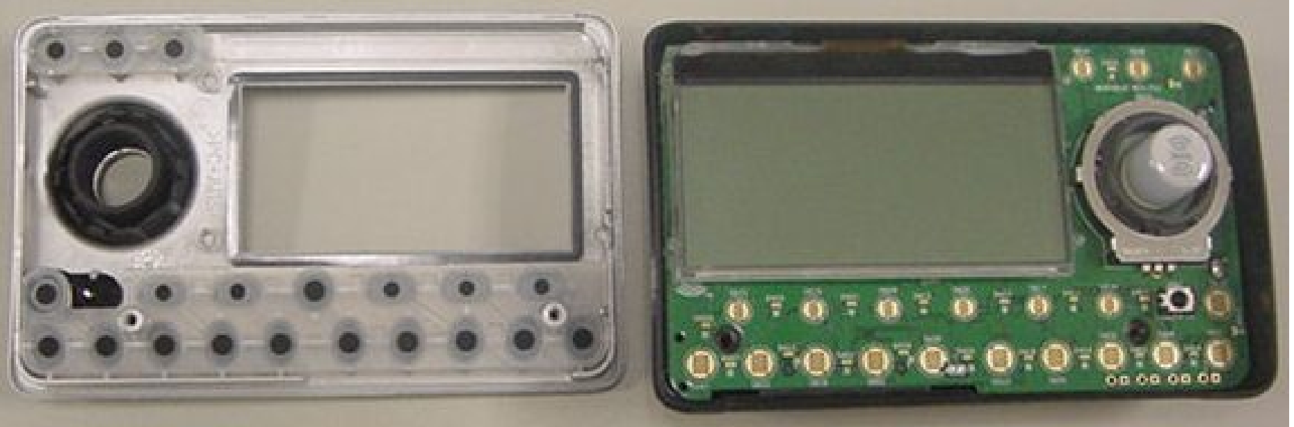
Case Open with PCB Inside