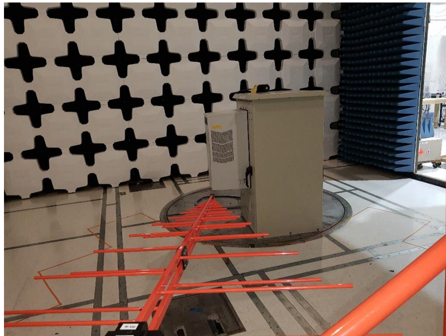
Cabinet Spurious Emissions, Test Setup Below 1 GHz