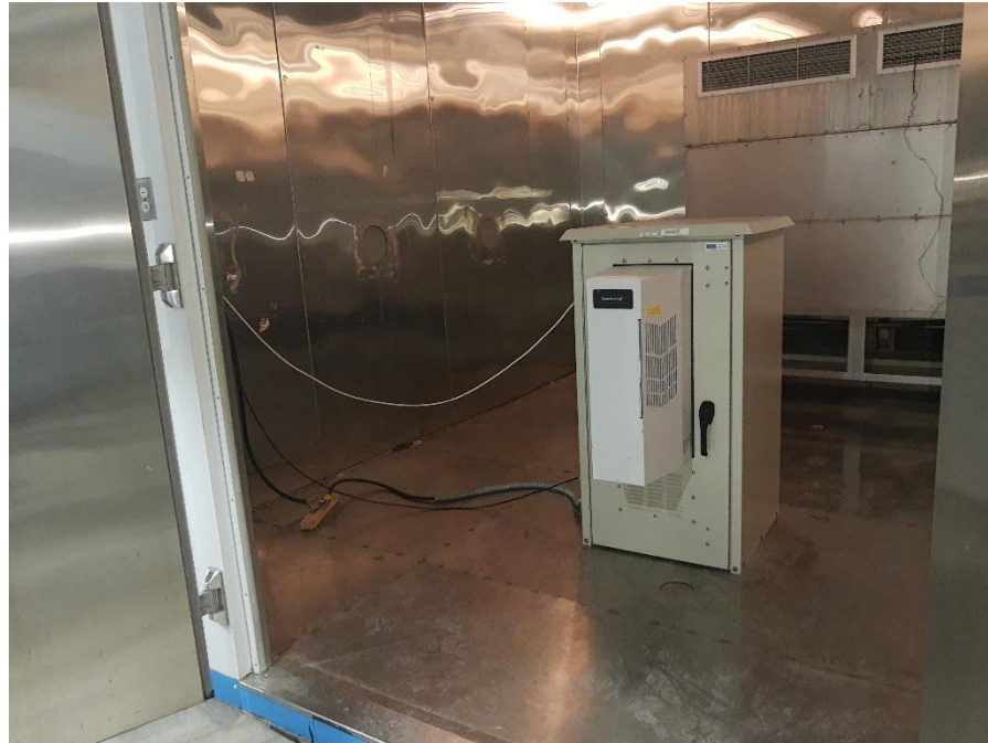
Frequency Stability, Setup Photo