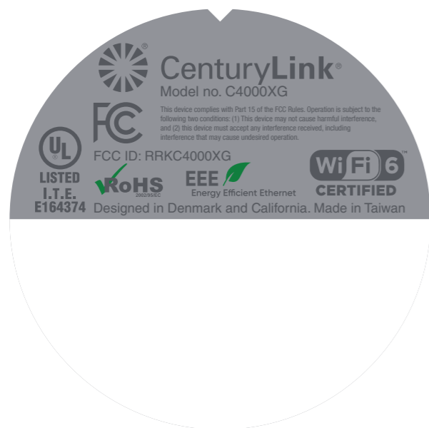
外印印刷稿 for printing