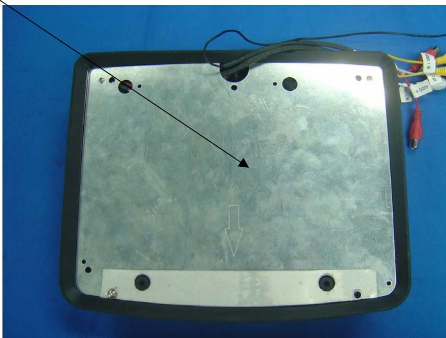
Figure 2 General Appearance