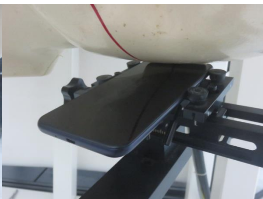
Left Tilt 15°