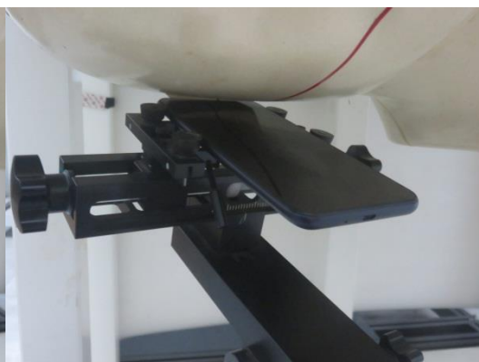
Right Tilt 15°