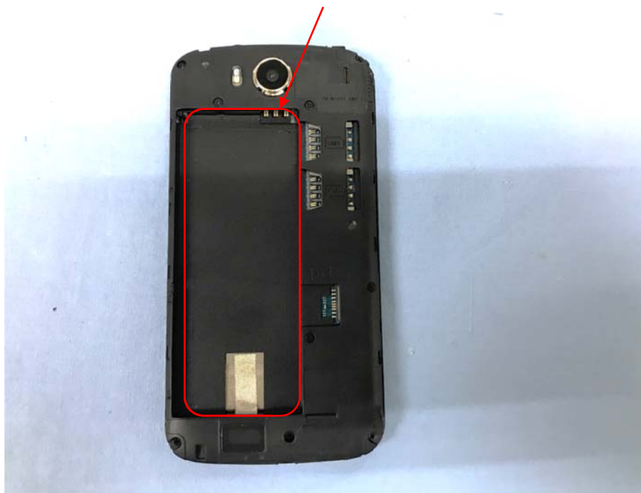
FCC ID Label Location