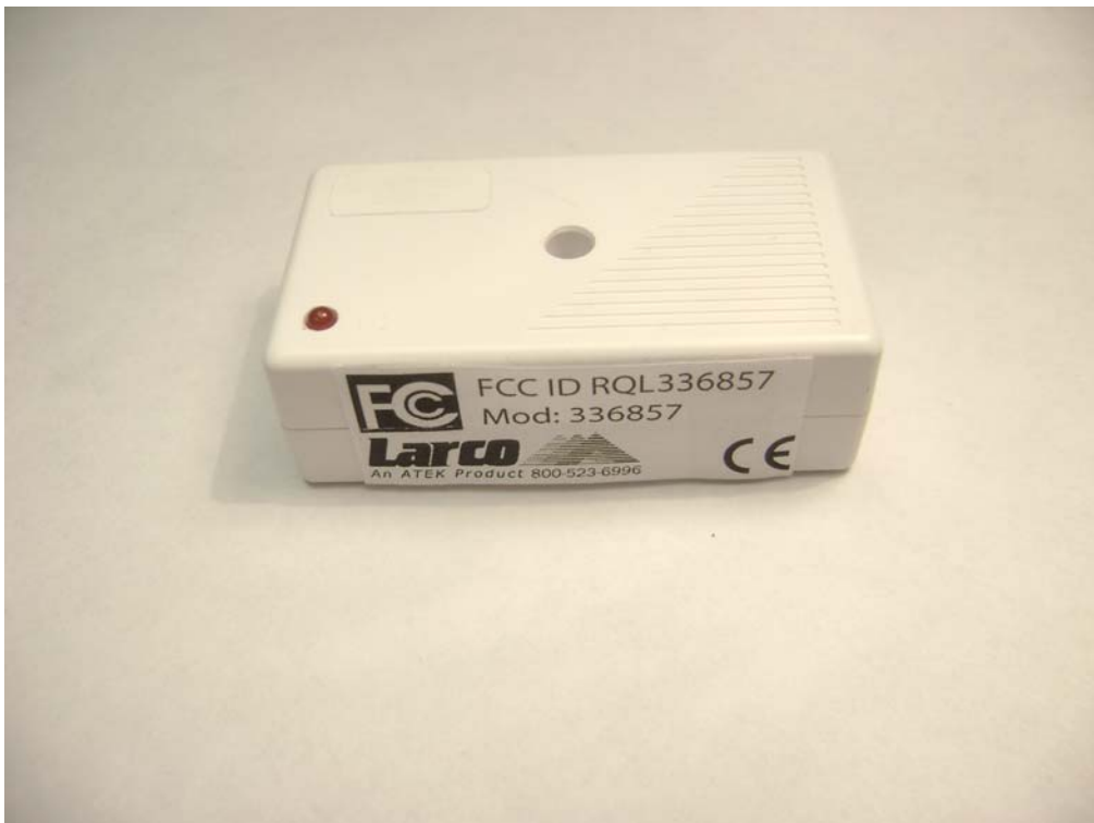
Figure 2 Front side