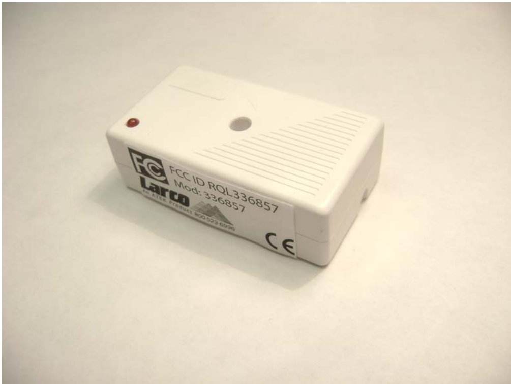
Figure 1 Top - Front - Right side