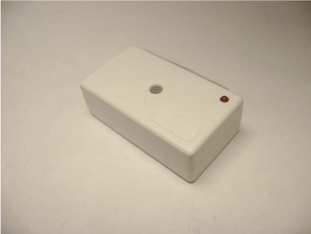
Figure 3 Back side