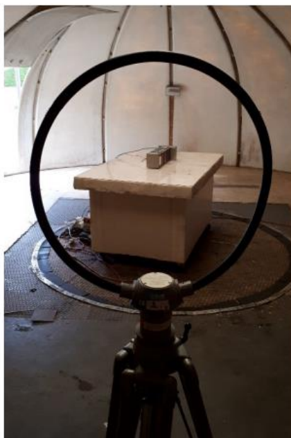
Photograph for Field strength outside of the bands 13.110-14.010 MHz