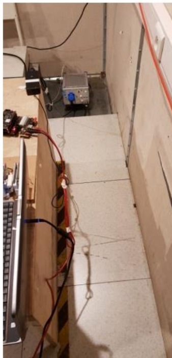
Photograph for AC Power Line Conducted Emissions (Rear view)