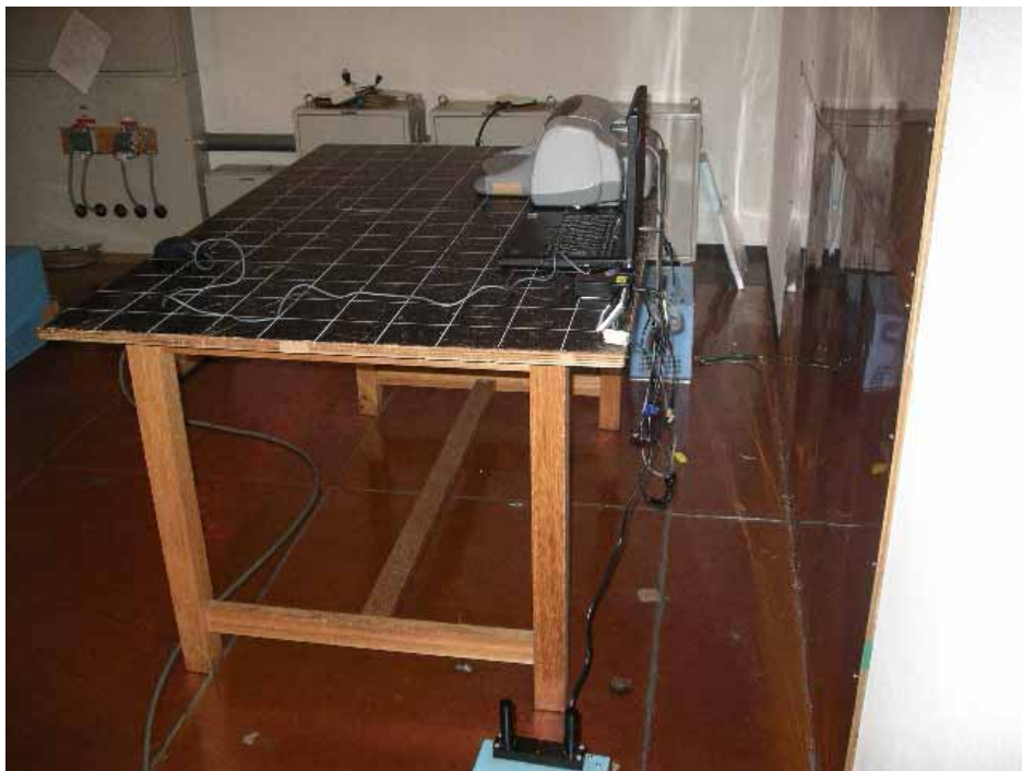
- Side View -

Photograph present configuration with maximum emission