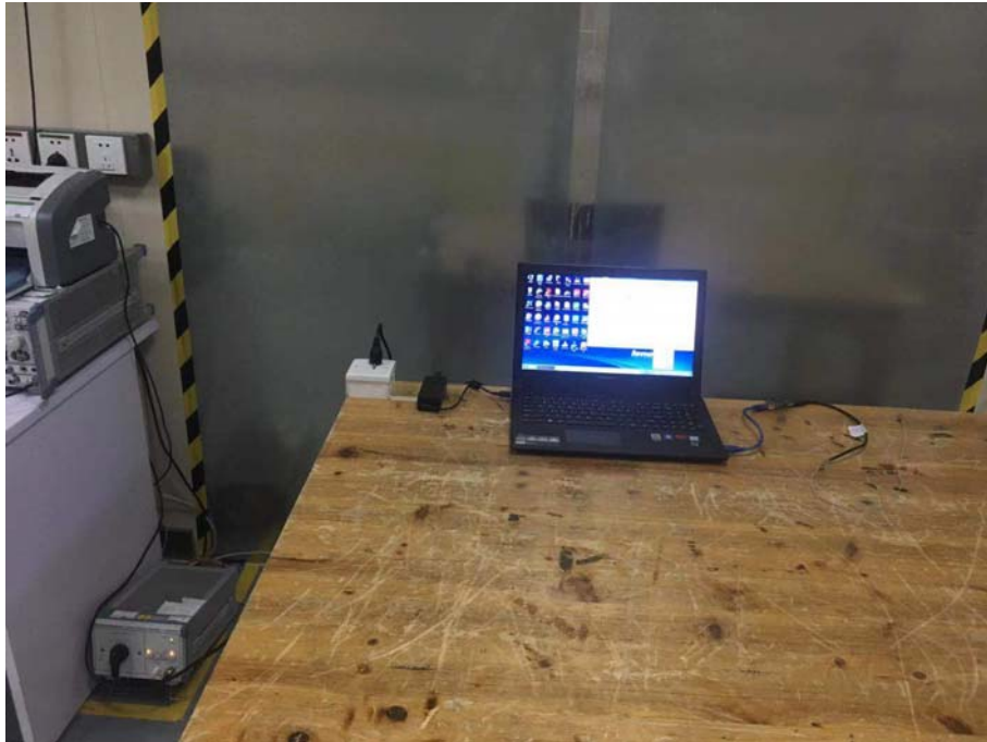
Conducted Measurement Photos(ANT2)