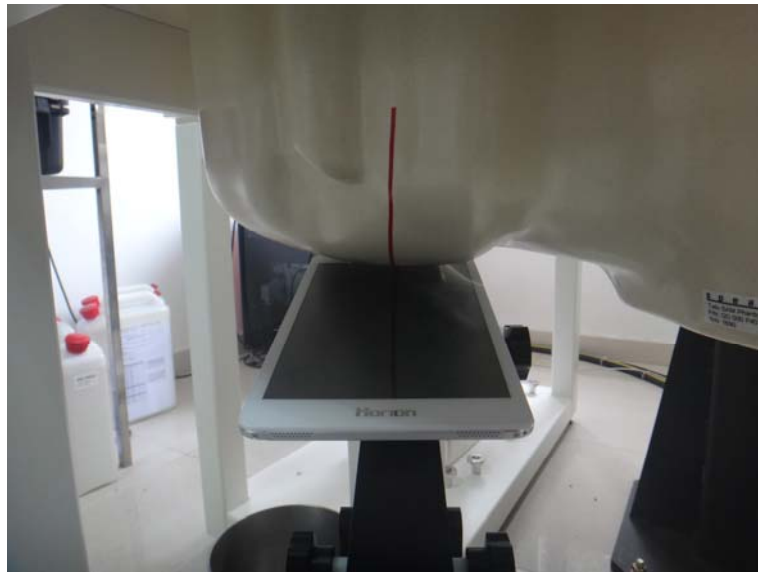
Right Head Tilt Setup Photo