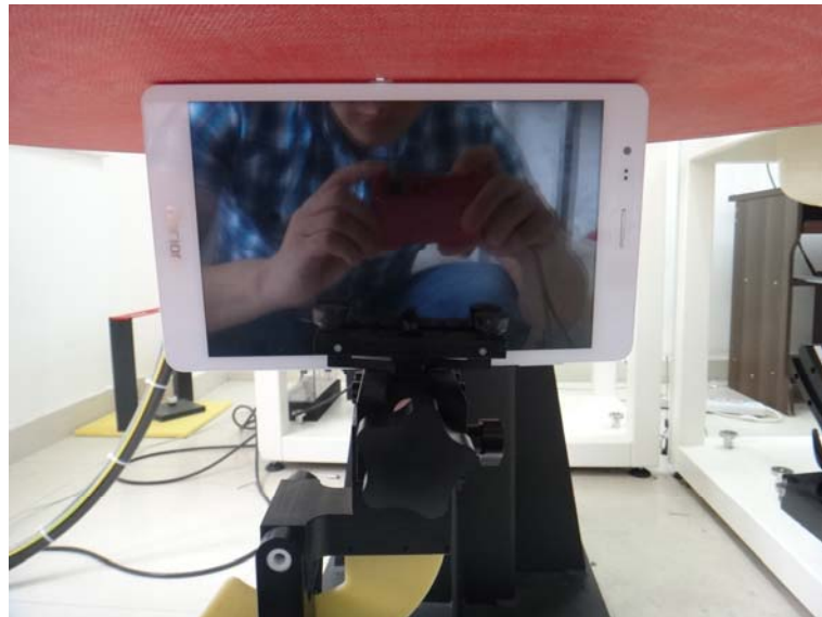
0mm Body-worn Left Side Setup Photo