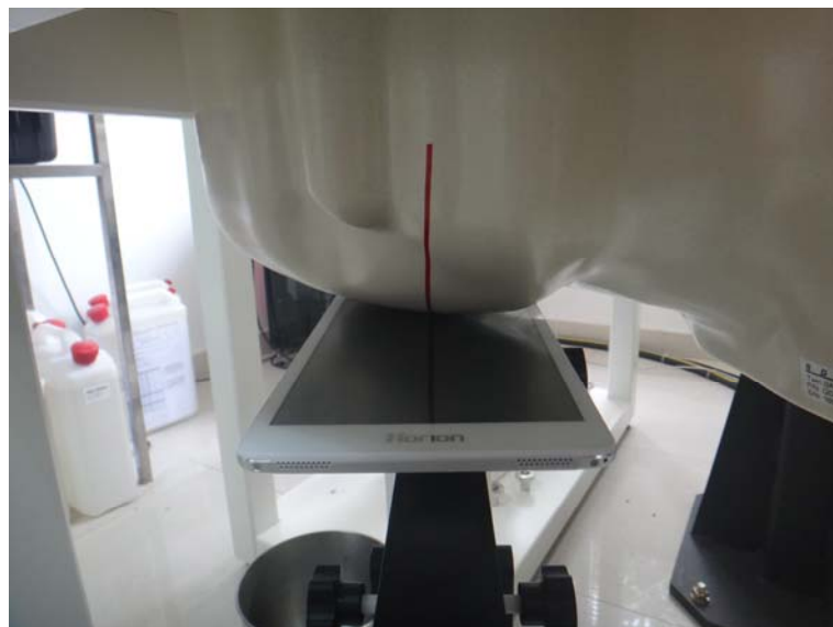
Right Head Touch Setup Photo