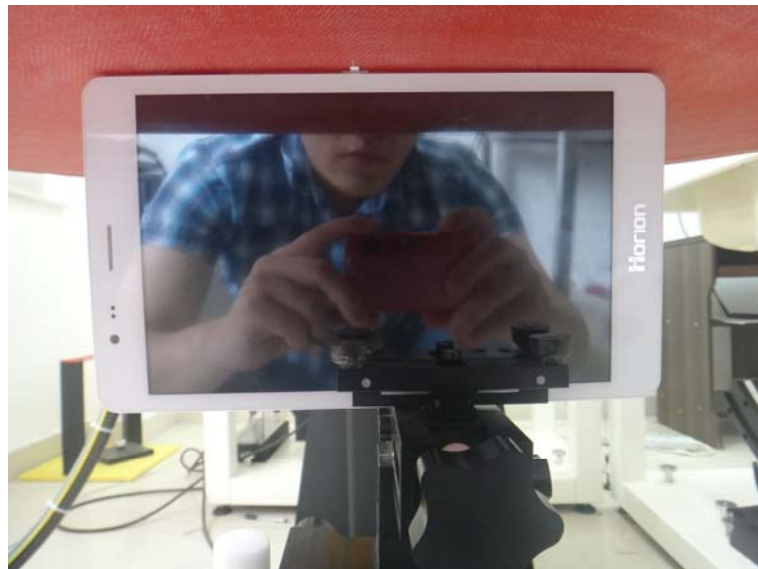
0mm Body-worn Right Side Setup Photo