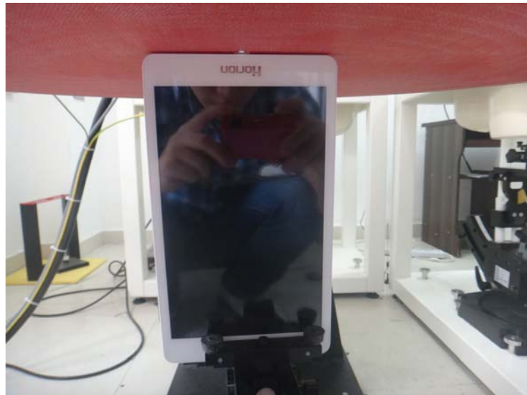
0mm Body-worn Bottom Side Setup Photo