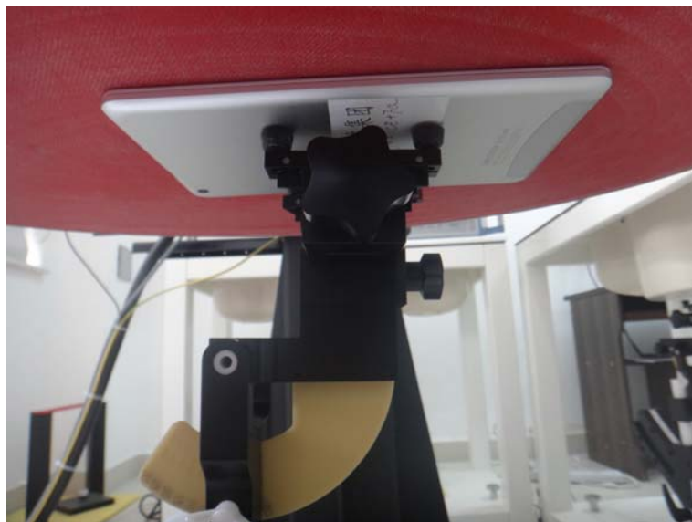
0mm Body-worn Front Side Setup Photo