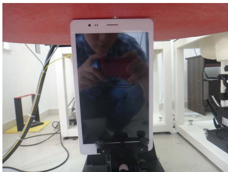
0mm Body-worn Top Side Setup Photo