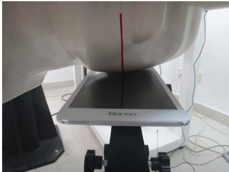
Left Head Touch Setup Photo