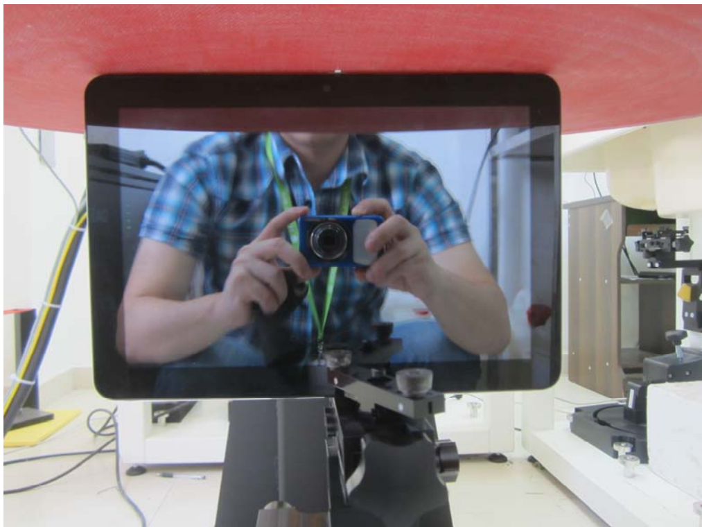
0mm Body-worn Top Side Setup Photo