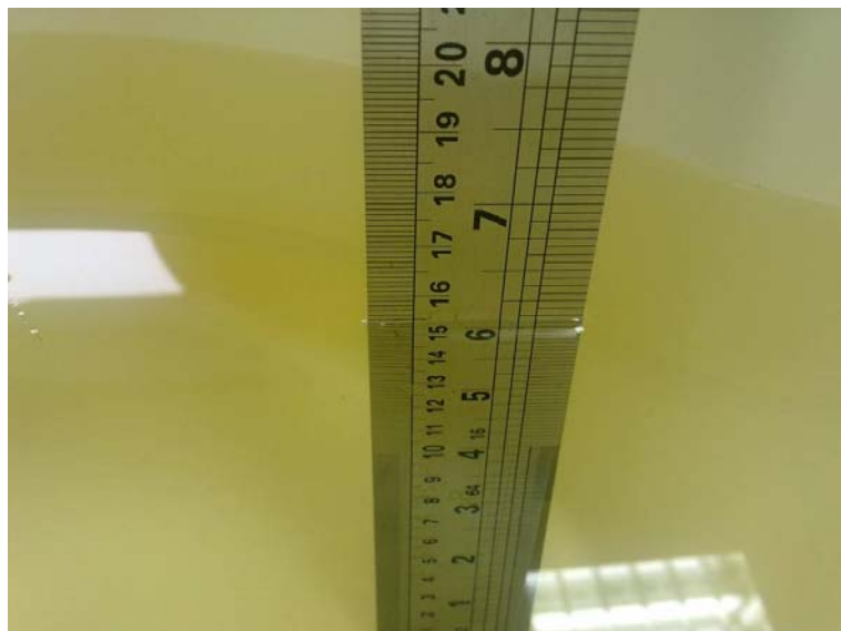
Photograph of the depth in the Phantom (2450MHz)