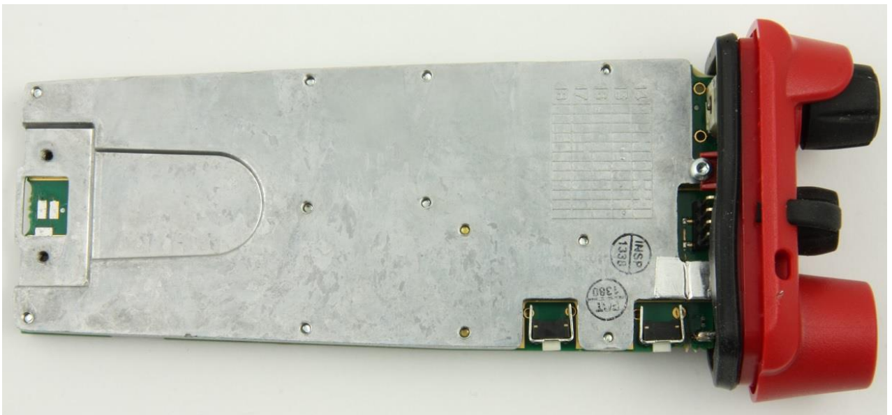
Transceiver module 3965 (PCB bottom): 60-150001