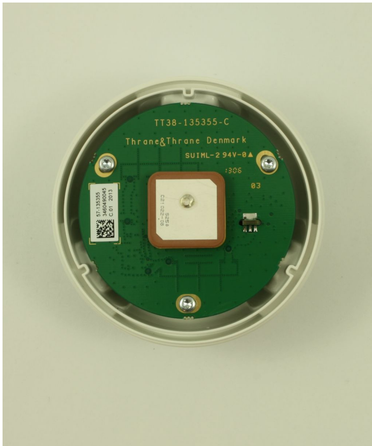
SAILOR 6285 top cover off