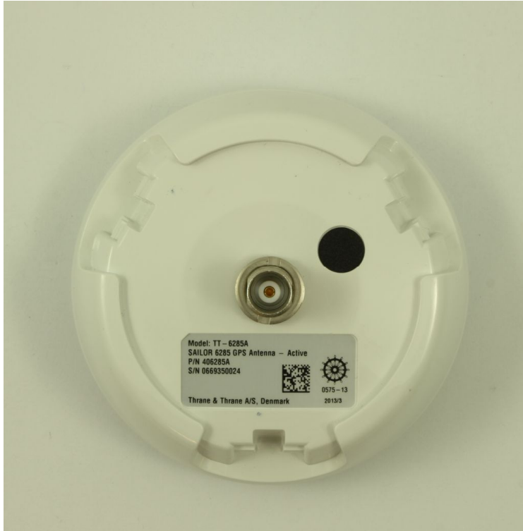
SAILOR 6285 bottom view