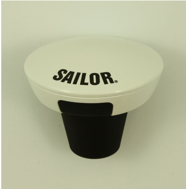
SAILOR 6285 in bracket