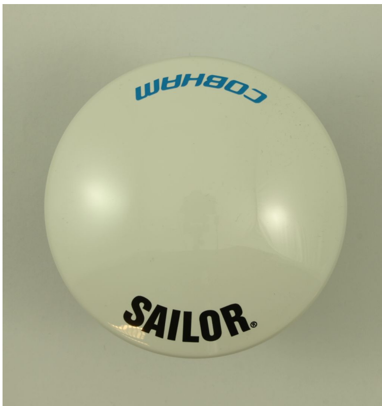
SAILOR 6285 top view