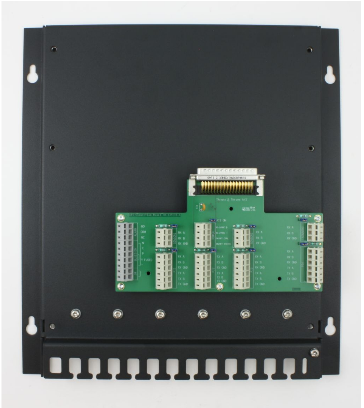
SAILOR 6283 connection board with cover off