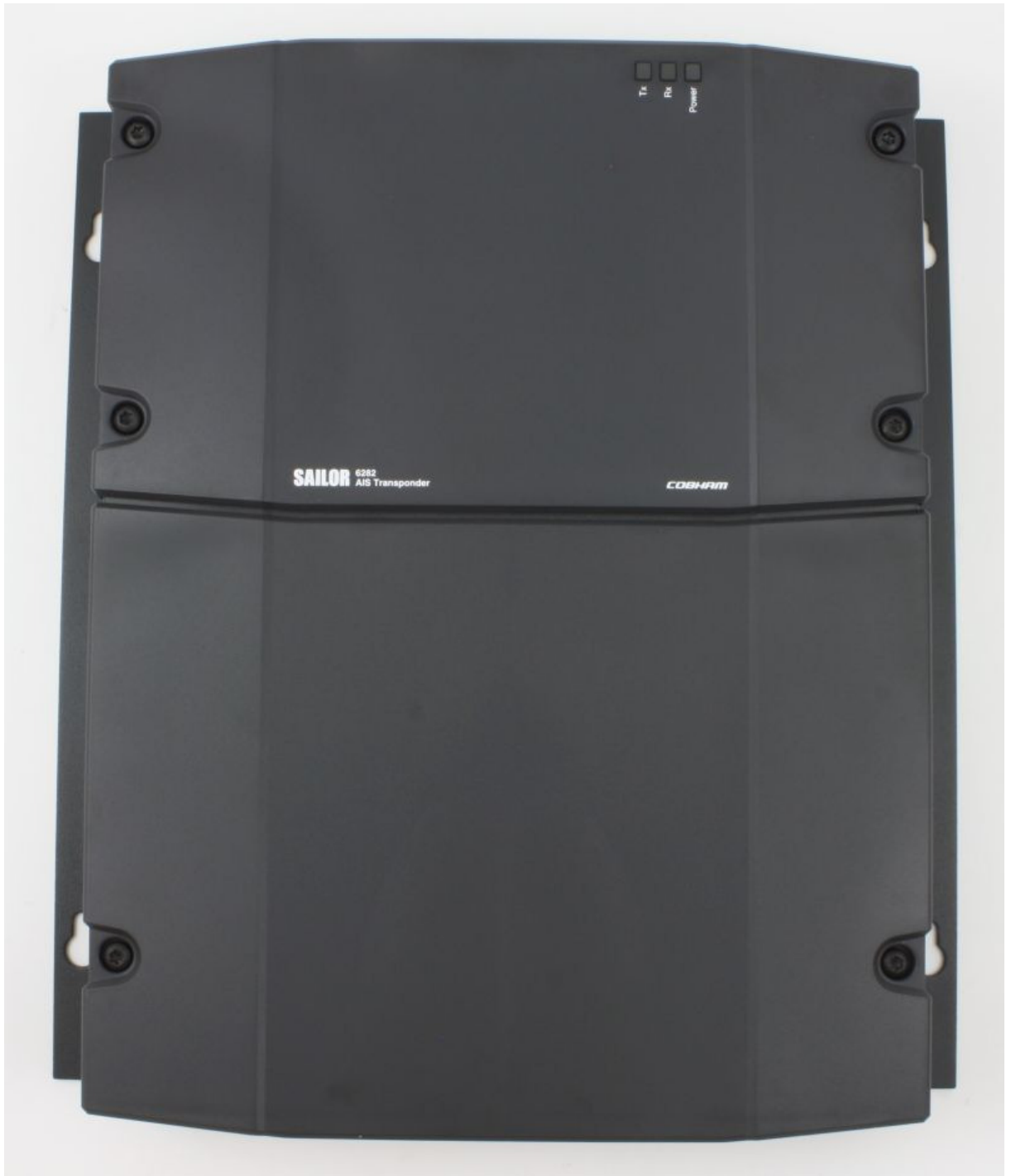
SAILOR 6283 and SALOR 6282 assembled