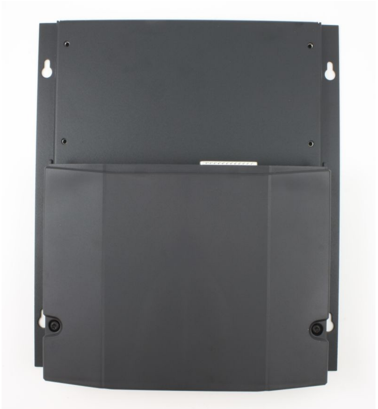
SAILOR 6283 top view