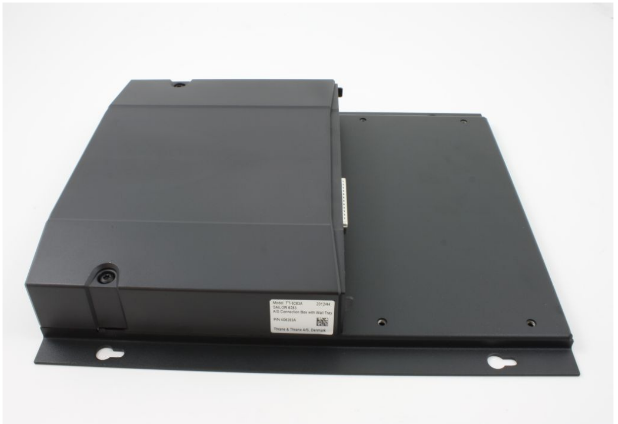
SAILOR 6283 side view with product label