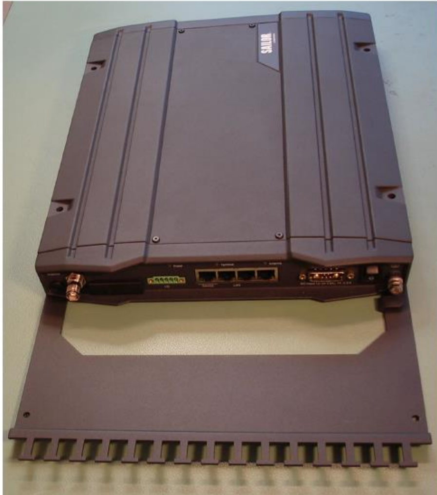
SAILOR 404338A Below Deck Unit

Thrane & Thrane A/S trading as Cobham SATCOM, Denmark Photos external and internal