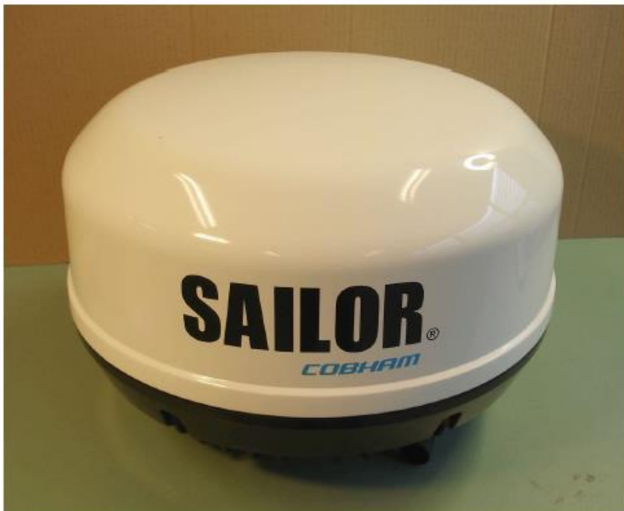
SAILOR 404352A Above Deck Unit

Thrane & Thrane A/S trading as Cobham SATCOM, Denmark Photos external and internal