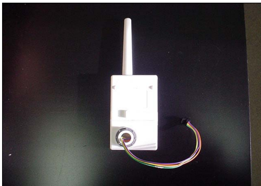
Rear view of the EUT, showing the connection port and the 4-wire cable.