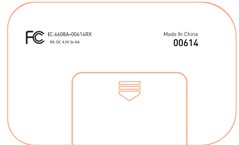
SCREEN PRINT PMS warm gray 3 C