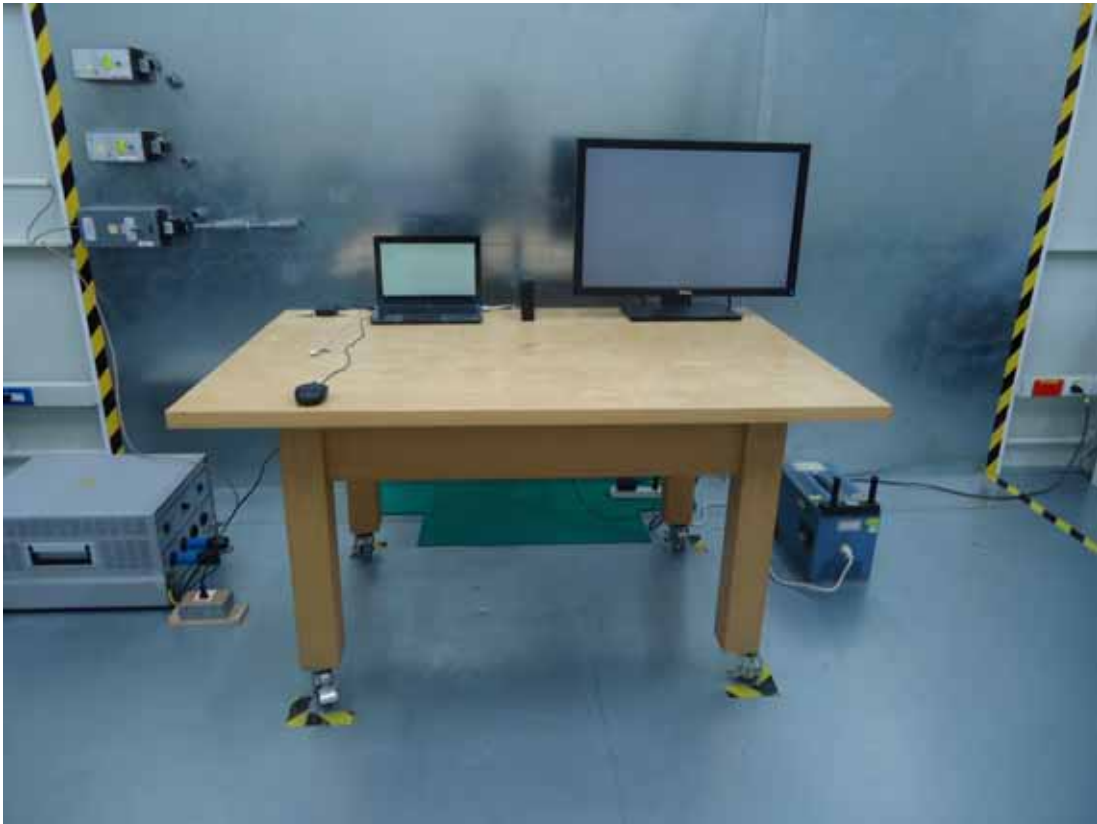
FRONT VIEW OF CONDUCTED MEASUREMENT