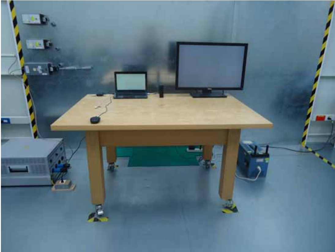
FRONT VIEW OF CONDUCTED MEASUREMENT