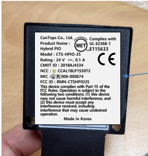
Bottom view of EUT